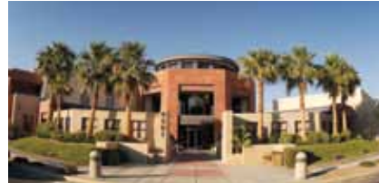
• The Las Vegas Institute for Advanced Dental Studies.

For more information on the Las Vegas Institute for Advanced Dental Studies, visit www.lviglobal.com .