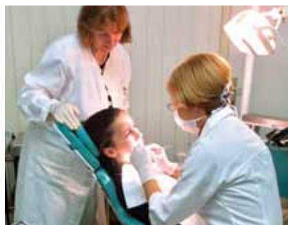
• The Mission of Mercy event on Sunday will provide free care to about 1,000 adults and children.

This Mission of Mercy (MOM) event comes to San Antonio as part of ADA 2014 and includes more than 1,000 volunteer dentists, hygienists, assistants, students and community workers from across Texas and the nation. Almost 30 sponsors are providing