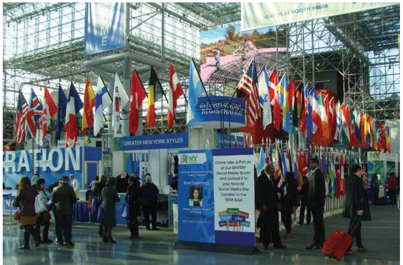
• Flags from around the world hang over the registration desk at the Greater New York Dental Meeting, signifying the meeting's global outreach.

Anchored by a scientific pavilion at booth No. 1313 and spanning across four aisles nearby, the German Pavilion encompasses more than 10,000 square feet and features more than 40 German dental companies (including