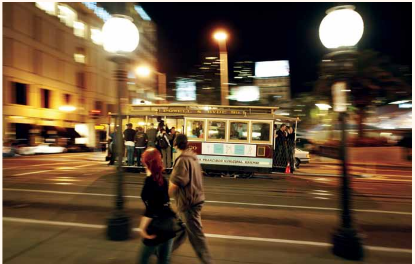
The cable car system, one of the highlights of San Francisco.