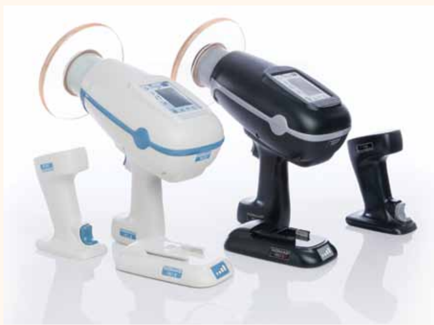
The NOMAD Pro 2.