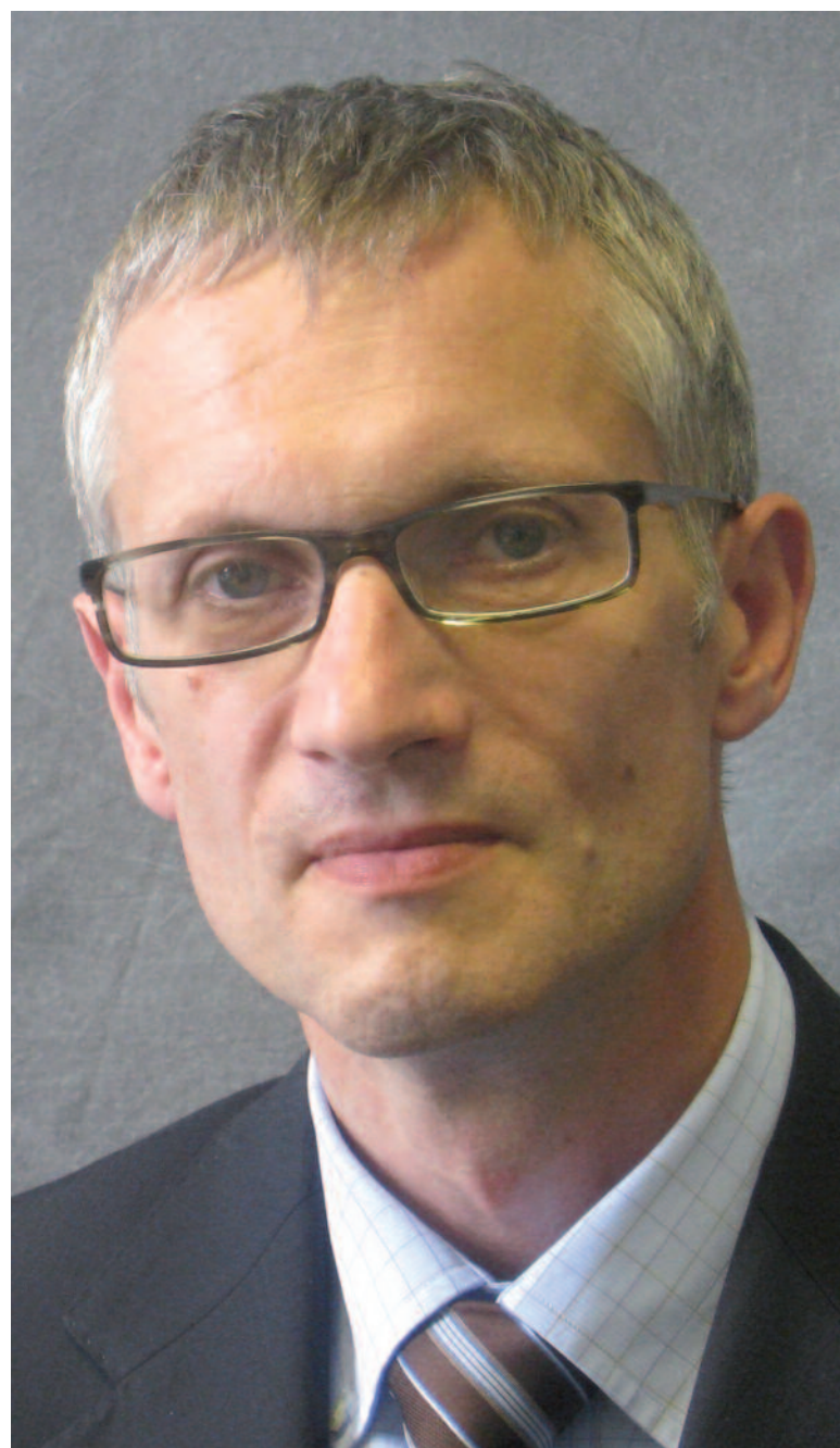
■ Prof. Stephen Porter (DTI/Photo courtesy of UCL Eastman Dental Institute, UK)

The rise in some countries is gradual but sustained. Smoking to-