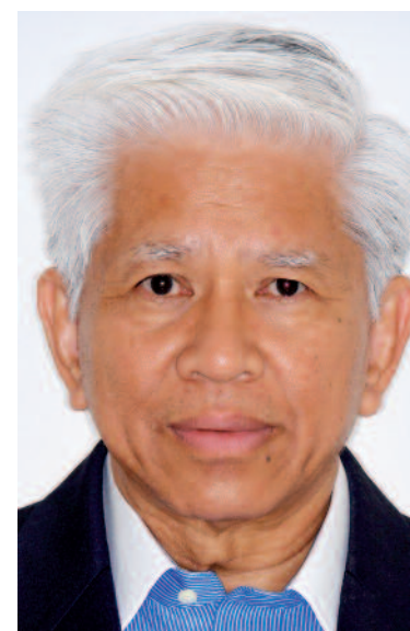
Prof. Prathip Phantumvanit, Thailand

Fluorescence) in order to detect mineral loss in enamel, as well as follow-up strategies, such as remineralisation and the use of sealant. Moreover, the visual FDI Caries Matrix, in terms of non-cavitated and cavitated lesions in enamel and dentine, has been proposed as a caries index for timely prevention and treatment. This early detection and diagnosis of dental caries will lead to proper prevention and control of caries before the development of a cavity, which can then only be treated.