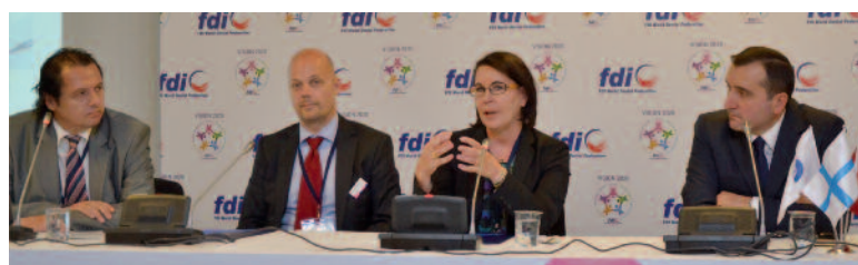
■ Representatives from both companies also talked about the new partnership at a press conference held yesterday in the Istanbul Congress Center.

Plandent's mission is to offer the latest technology and materials from