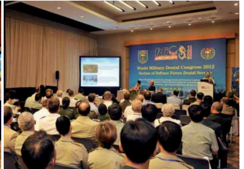
Delegates to the World Military Dental Congress listening to a presentation in the year 2012.