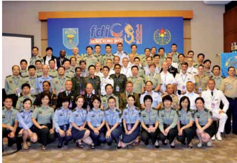
The SDFDS is welcoming new delegates from countries like Afghanistan this year.

In addition, management of dental service delivery, including performance assessment and improvement, readiness, dental management programmes, oral and maxillofacial treatment, as well as CAD will be in focus.