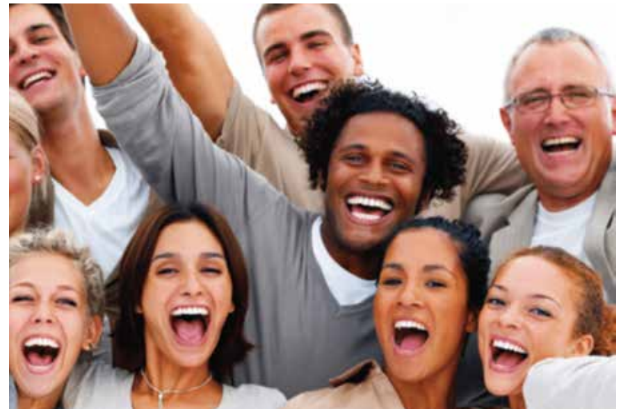
• These happy patients can be yours.

As patients have more and more choices for their dental care, don't lose a single patient because they fear coming to you. Give them the experience that keeps them coming back for years.