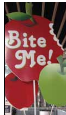
• Start your day with a bite, by picking up a delicious Canadian apple at the 'Bite Me!' apple kiosk, located on the second floor of the convention center as you make your way to the registration desks.