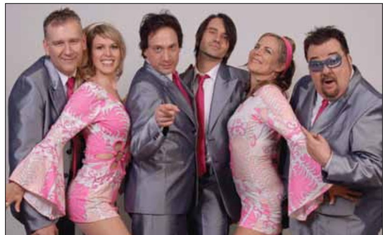
• On stage tonight, 'Dr. Strangelove,' one of Vancouver's most popular musical attractions.

Also at the registration desk, tickets should still be available ($15) for tomorrow's breakfast with stand-up comedian Brent Butt, from 8:30-9:30 a.m. in Ballroom A, Vancouver Convention Centre.