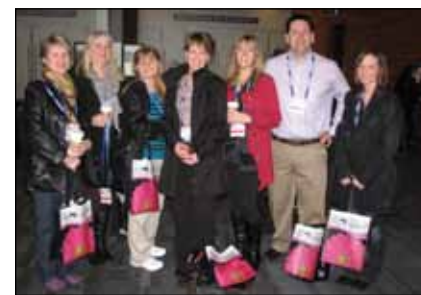
• This clinician and his staff had a rendezvous near the bag pick-up area before they went their separate ways for the day's education.