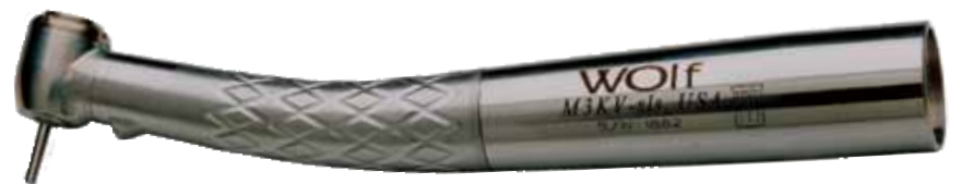
• Wolf handpieces, above, and Hawk loupes and lights, right, are just two of the many brands sold by Dental Savings Club.

Despite the fear it might invoke in patients, the conventional drill remains one of the most important instruments in a dental practice. Although maintaining and repairing