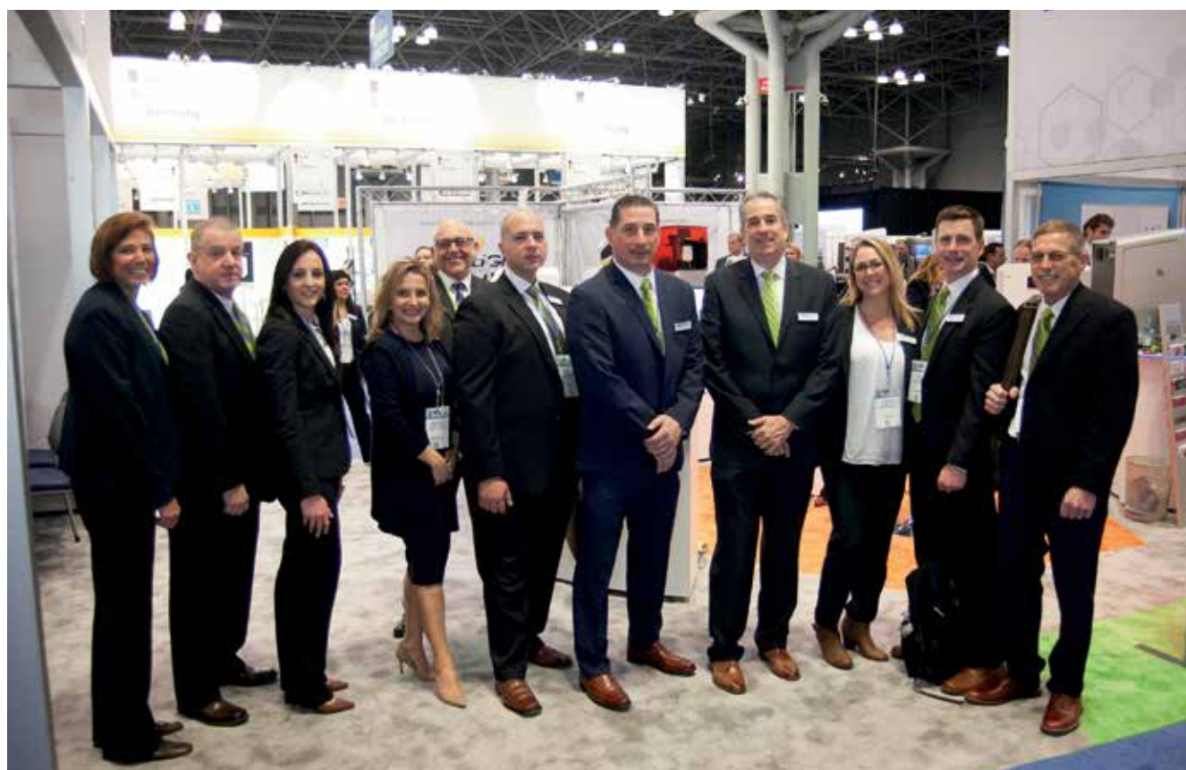
• The team at Benco Dental (booth No. 1617).