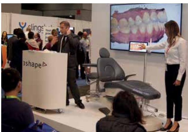
• The experts at 3Shape (booth No. 2626) offer a live presentation Sunday morning.