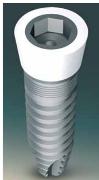
Hybrid implant (DTI/TBR Group)

The result was the TBR Hybrid implant: a one-stage titanium implant with a zirconia