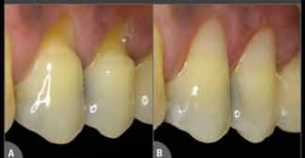
BEAUTIFIL Flow Plus Class V Case Study