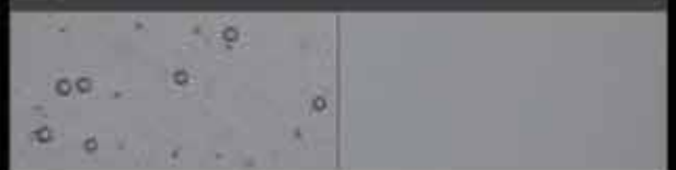
Beautiful Flow Plus No Bubbles