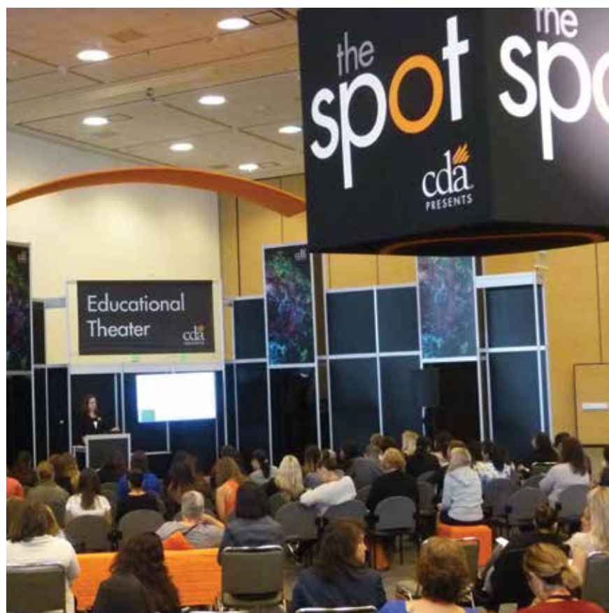
• A crowd gathers at the Spot educational theater during the 2017 CDA Presents The Art and Science of Dentistry.