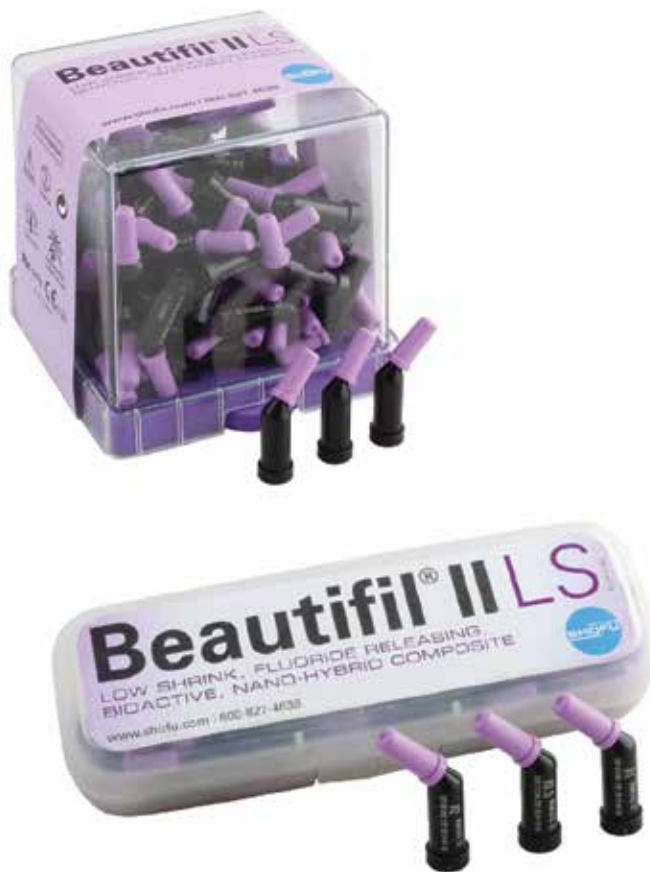
• Beautifil II LS.

tively), maintains ideal color stability and polishes in an instant, producing a long-lasting sheen, according to the company.