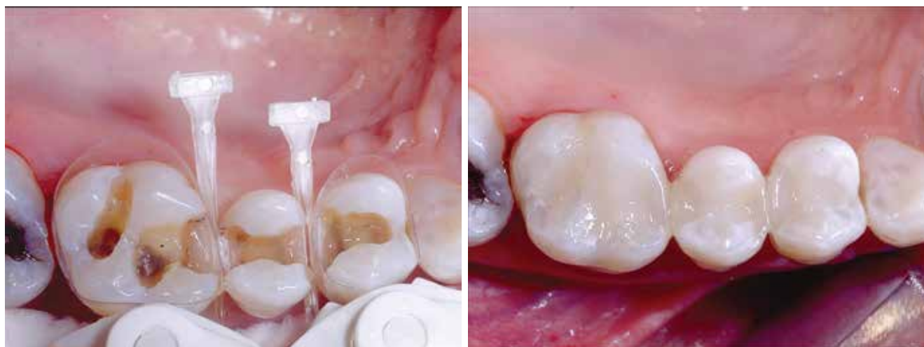
• Functional and naturally beautiful restorations created with Beautifil II LS.

Highly filled, 83 wt percent, Beautifil II LS demonstrates excellent compressive and flexural strength (ca. 370 MPa and 120 MPa, respec-