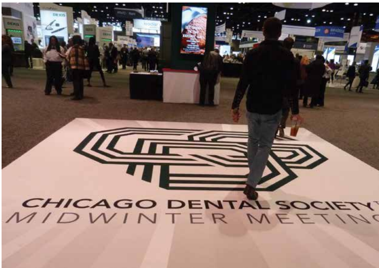
• Attendees enter the exhibit hall during the 2018 Chicago Midwinter Meeting.