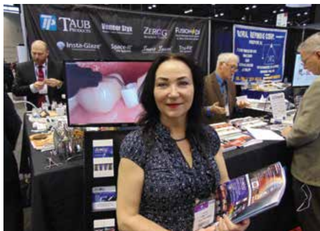
• A number of new and innovative offerings are available at TAUB Products (booth No. 1911).