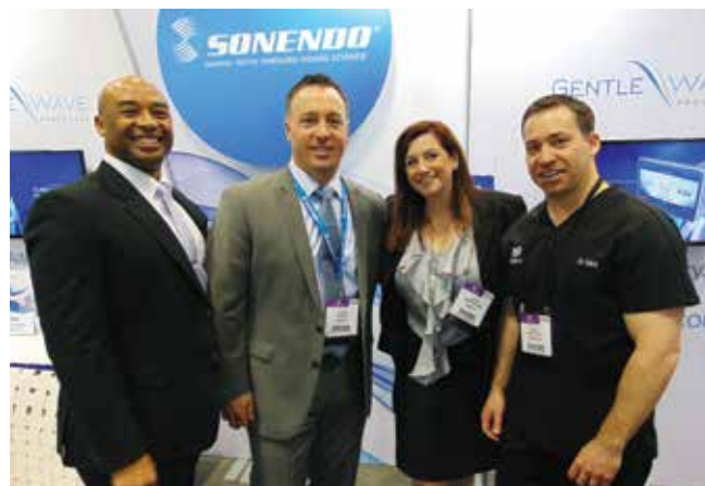
• The experts at Sonendo (booth No. 1229) are on hand to tell meeting attendees about the GentleWave technique for endodontic disinfection.