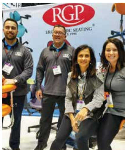
• Drop by the RGP booth, No. 3315, to test out some new chairs for your practice.