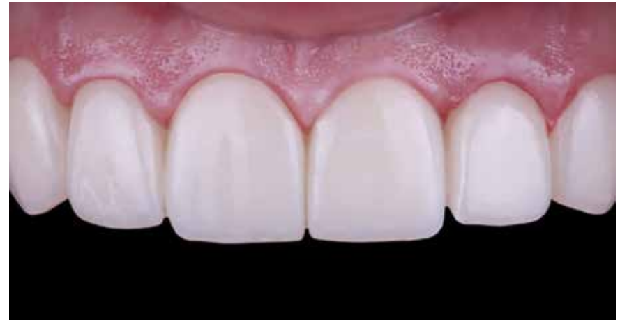
DenMat offers minimally invasive smile design.

To learn more about ART, visit DenMat at booth No. 5010. You may also call (800) 433-6628 or visit denmat.com .