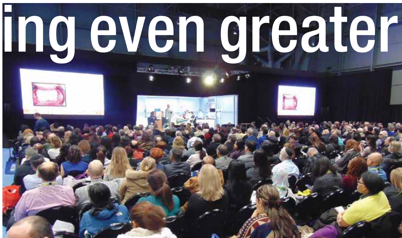
• The live dentistry arena on the exhibit hall floor is filled with meeting attendees during the 2017 Greater New York Dental Meeting. Check the app to learn all about this year’s sessions.

Viewed as a whole with all the other seminars, hands-on workshops, essays and scientific poster sessions, the overall meeting’s agenda enables dental professionals to design education tracks focusing on virtually any aspect of dentistry, including practice management, dental hygiene,