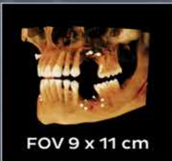
FOV 9 x 11 cm