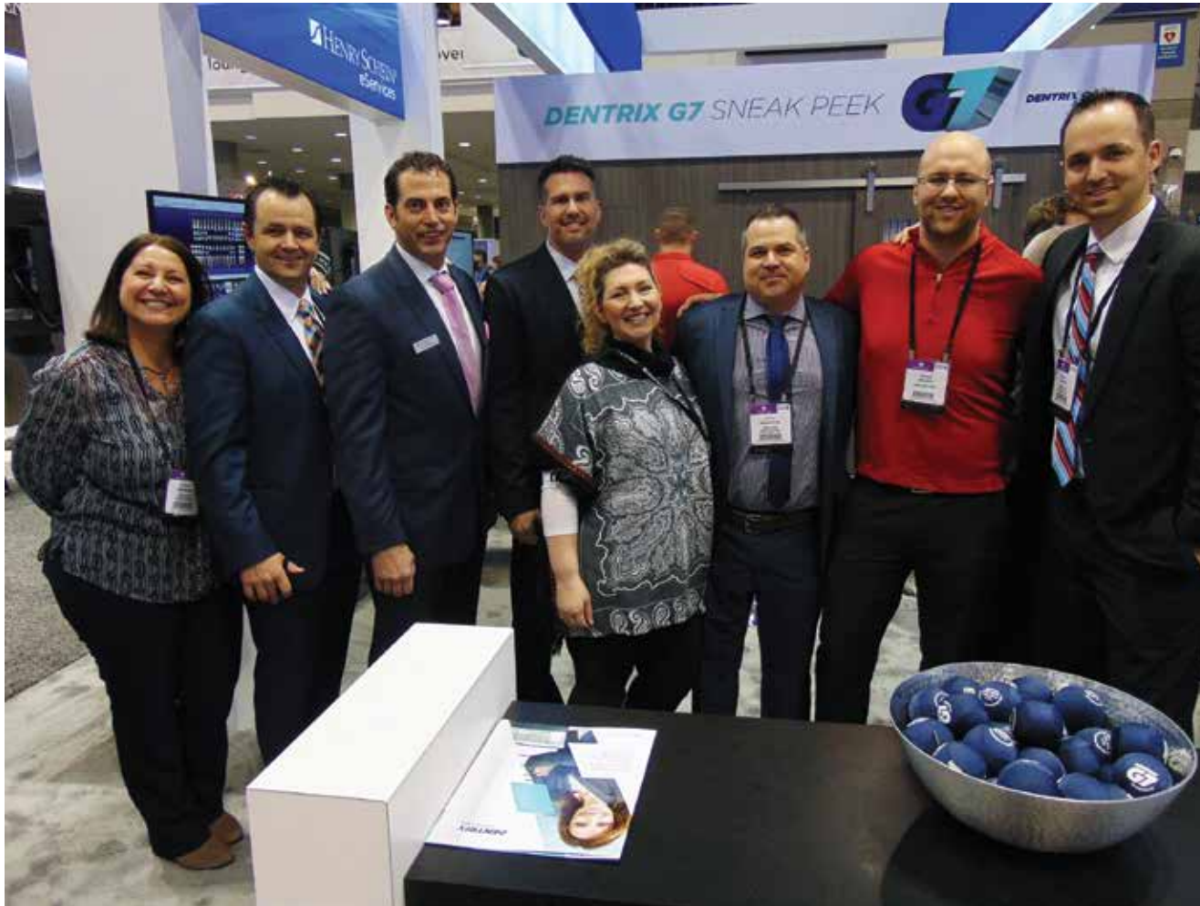
• The folks from Henry Schein eServices (booth No. 2819) are eager to tell you about Dentrrix G7.