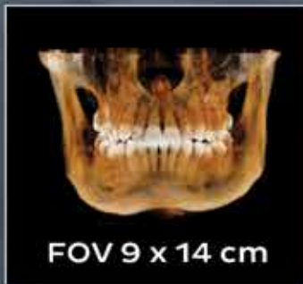
FOV 9 x 14 cm

Schedule a demo today at go.kavokerr.com/401375