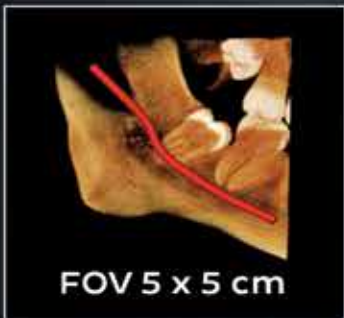
FOV 5 x 5 cm

From endo to airway studies, the new KaVo OP™ 3D is a flexible and affordable system that makes obtaining the right image achievable. With an intuitive interface, automated protocols, and customizable fields of view—plus the ability to take standard or pediatric 2D panoramic images, the KaVo OP 3D is the right system for your practice, both now and in the future.