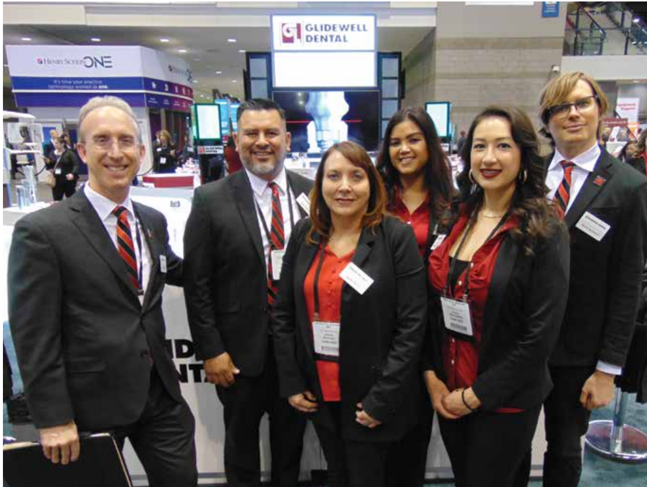
• The team members from Glidewell gather for a group photograph at their booth (No. 3219).