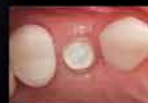
Cured Liquid Magic™ Resin Barrier. Abutment ready for final insert of restoration.