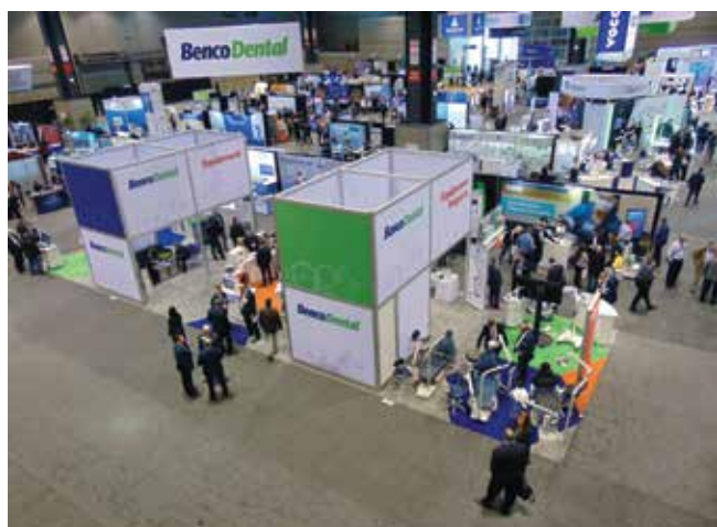
• The Benco Dental booth (No. 3834) as seen from above.