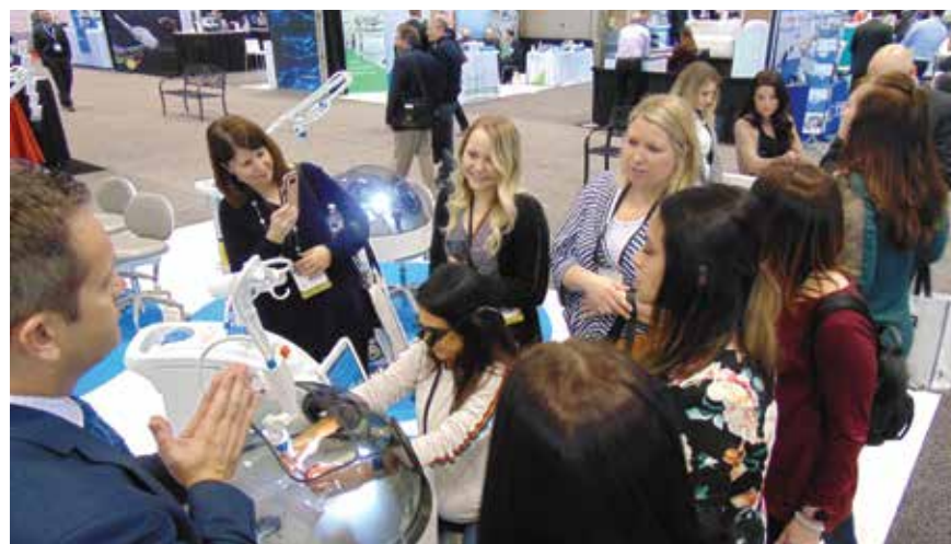
• Meeting attendees learn about laser technology options at Convergent Dental (booth No. 1643).