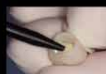
ZERO-G™ Bio-Implant Cement is loaded into restoration.