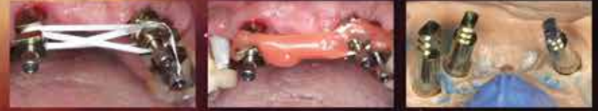
Floss is applied around copings to become internal framework of verification jig.