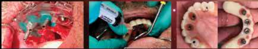
CHROME GuidedSMILE Stackable Guide System. Keystone TI Chimneys are torqued to spec.