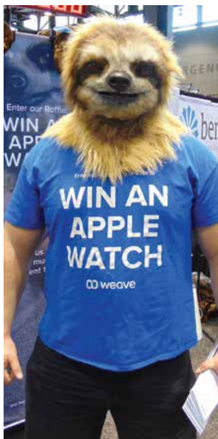
• Ask the sloth at Weave (booths No. 628, 1343 and 4643) about entering a drawing to win an Apple Watch.