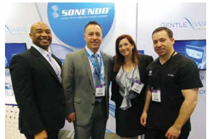
• The experts at Sonendo (booth No. 1229) are on hand to tell meeting attendees about the GentleWave technique for endodontic disinfection.