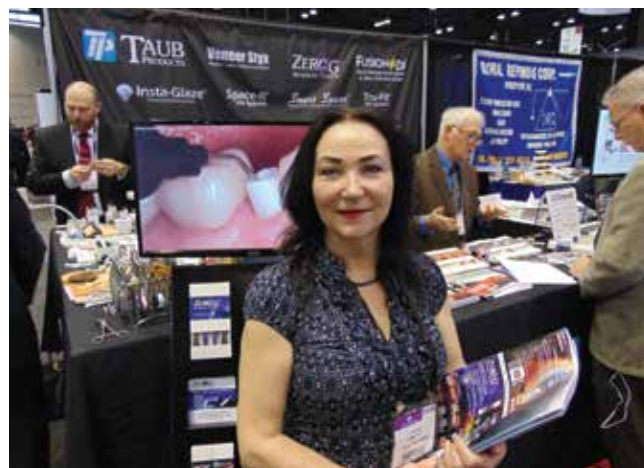
• A number of new and innovative offerings are available at TAUB Products (booth No. 1911).