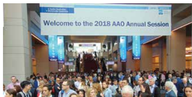
The Walter E. Washington Convention Center is filled with orthodontic professionals Saturday morning, at the beginning of the 2018 AAO Annual Session.