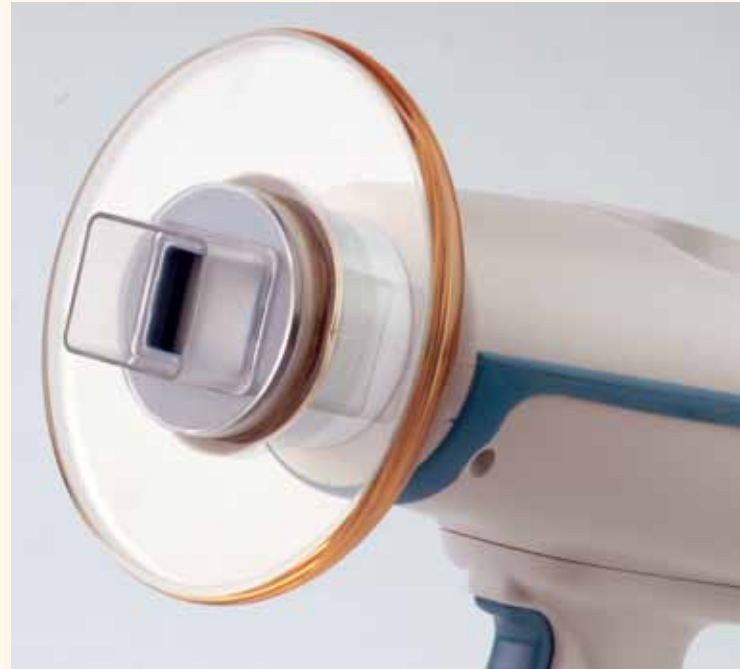
The Aribex NOMAD with the Rectangular Collimator Adapter.

To see the Aribex NOMAD and the new Rectangular Collimator Adapter, stop by the booth, No. 814.