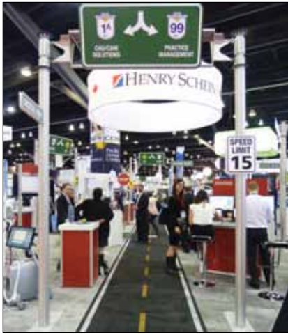
• The always-colossal Henry Schein booth debuts its traffic-control theme (No. 709) at the PDC, making it easier to find the company's many services and products.