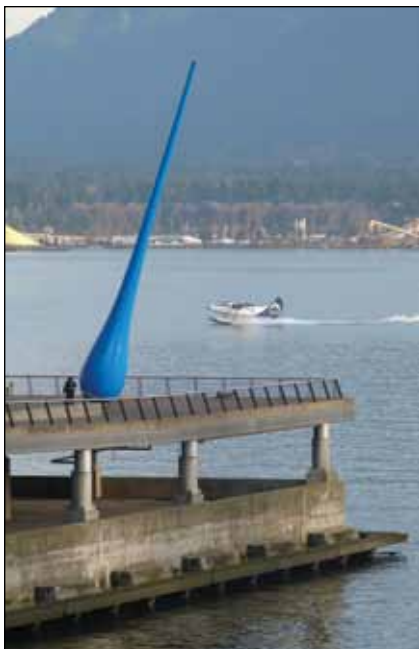
• A seaplane drops into Vancouver Harbour Thursday morning just outside the Vancouver Convention Centre.