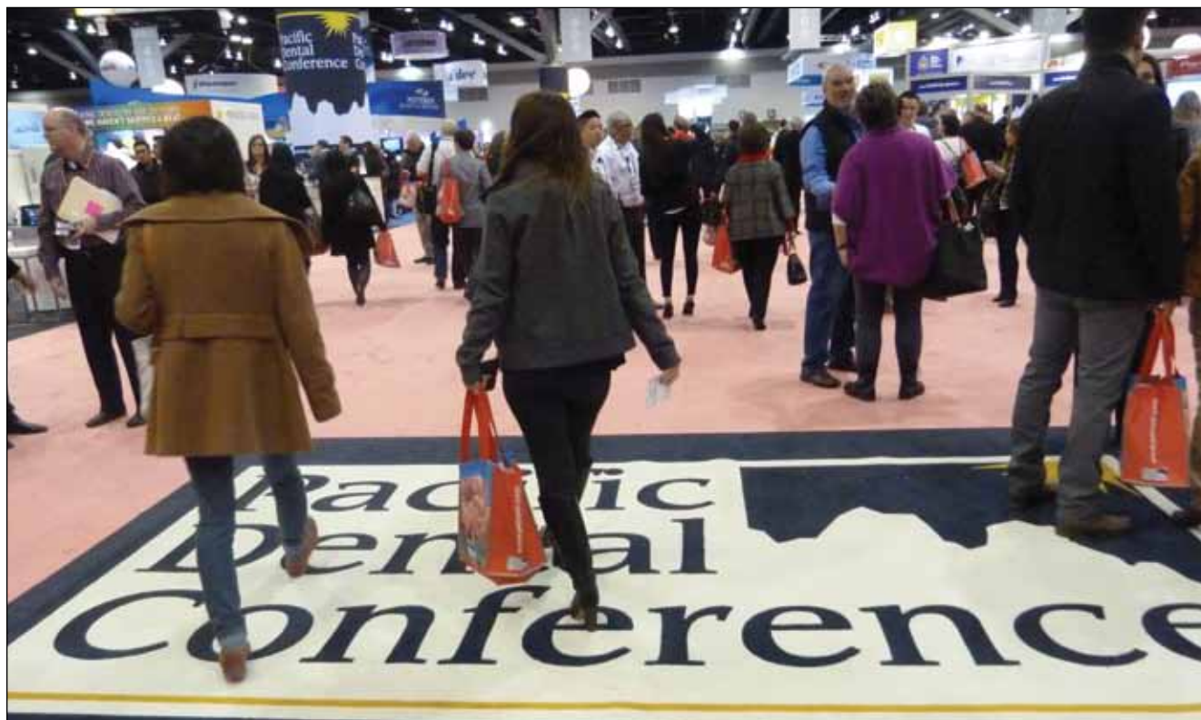
• Attendees stream into the Exhibit Hall on Thursday to enjoy lunch, watch the Live Dentistry Stage session and check out the dental industry’s latest products and services.