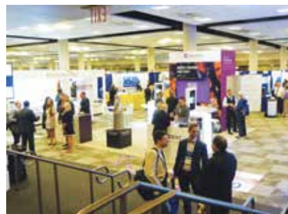
Attendees cruise through the aisles of booths in the AAID Exhibit Hall.

• Tired of broken hybrid dentures? Stop by the Glidewell Dental booth,