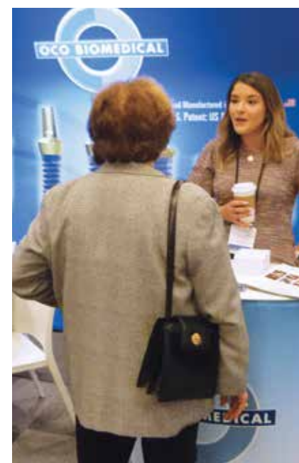
• Learn more about OCO Biomedical complete implant solutions at booth No. 418.