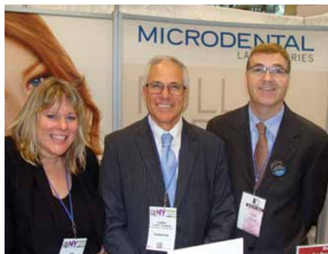
• Ask the team at MicroDental Laboratories, booth No. 4804, about its restorations and dental devices.