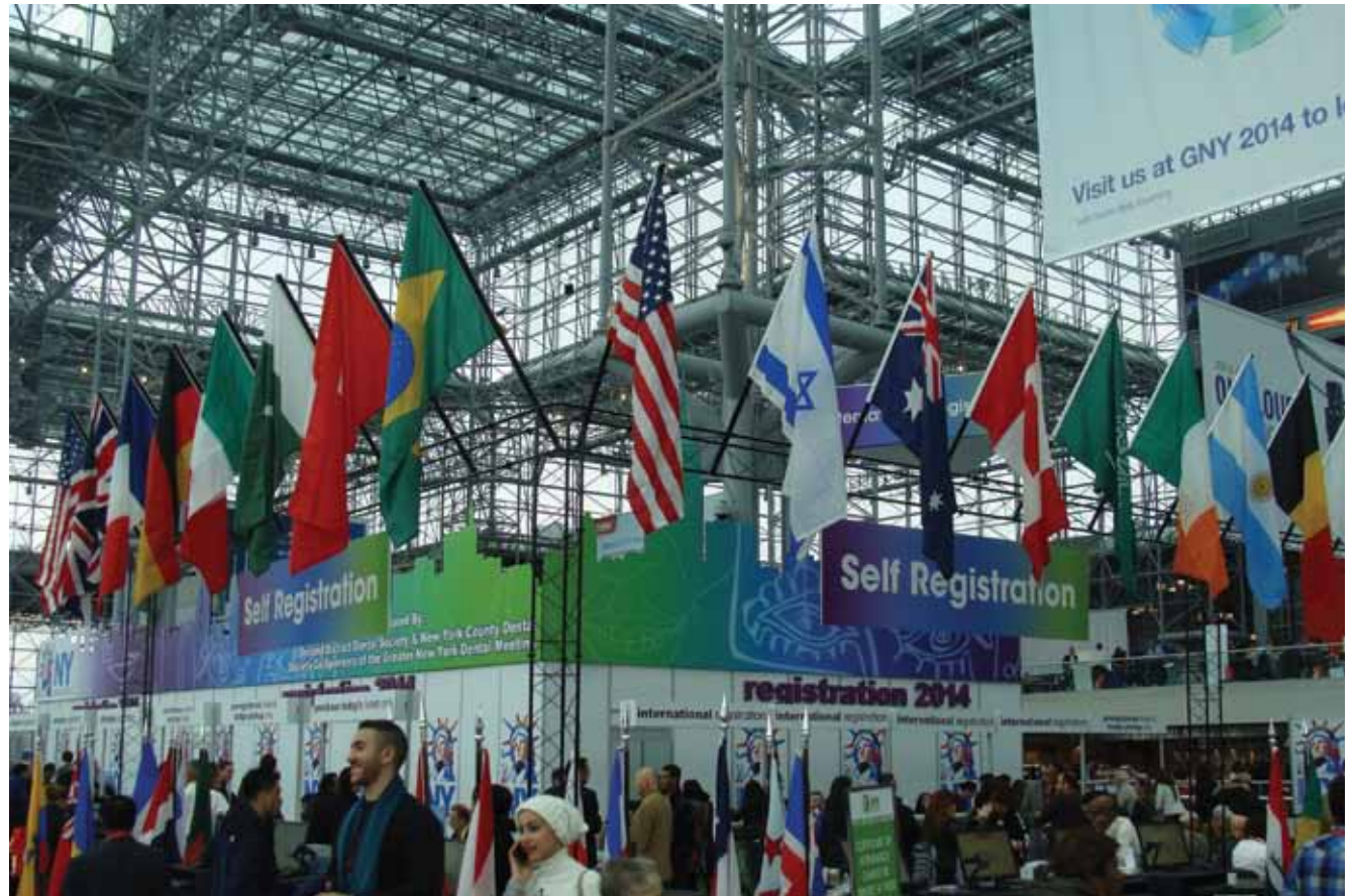
Flags of many nations are on display in the entrance area, emblematic of the many visitors from overseas, during the 2014 Greater New York Dental Meeting.

Opinions expressed by authors are their own and may not reflect those of Tribune America or Dental Tribune International.