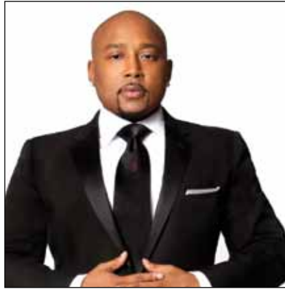
• Daymond John, star of ABC's 'Shark Tank,' will be the special guest speaker at today's first SIROWORLD Celebration event, being held at the TimesCenter in the Times Square District.