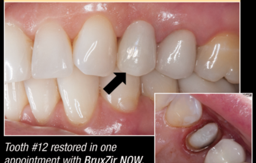
Tooth #12 restored in one appointment with BruxZir NOW.

The first fully sintered chairside zirconia with No Oven Wait!