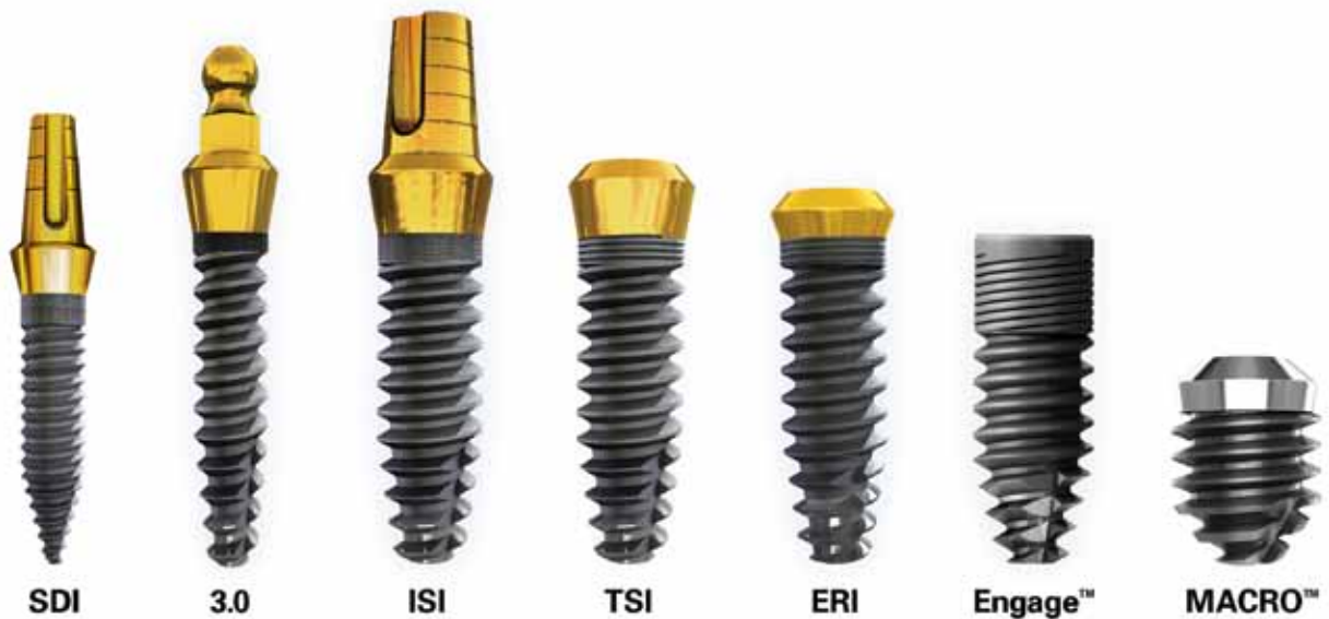
• OCO Biomedical's Dental Implant System.