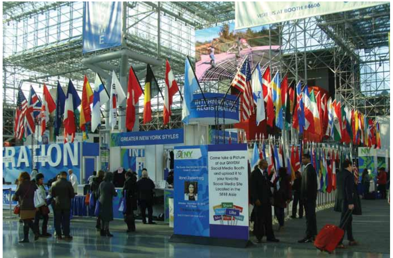
• Flags from around the world hang over the registration desk at the Greater New York Dental Meeting, signifying the meeting's global outreach.

Anchored by a scientific pavilion at booth No. 1313 and spanning across four aisles nearby, the German Pavilion encompasses more than 10,000 square feet and features more than 40 German dental companies (including