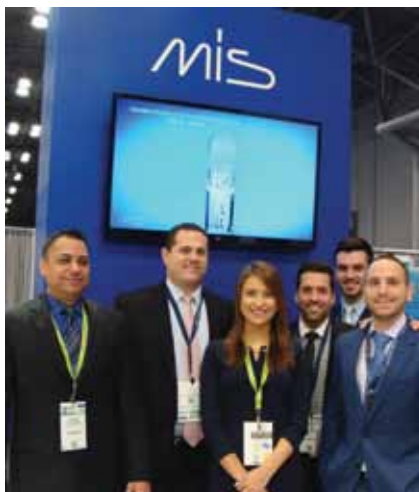
• The gang at MIS Implants Technologies (booth No. 4636).