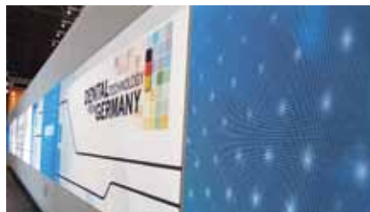
• The massive German Pavilion's science lab is impossible to miss in the 1300 aisle.

is Aböva Health in booth No. 940. The company is here from Italy with a product being introduced to the U.S. market: The Teethan dental contact digital analyzer, which is so new here,