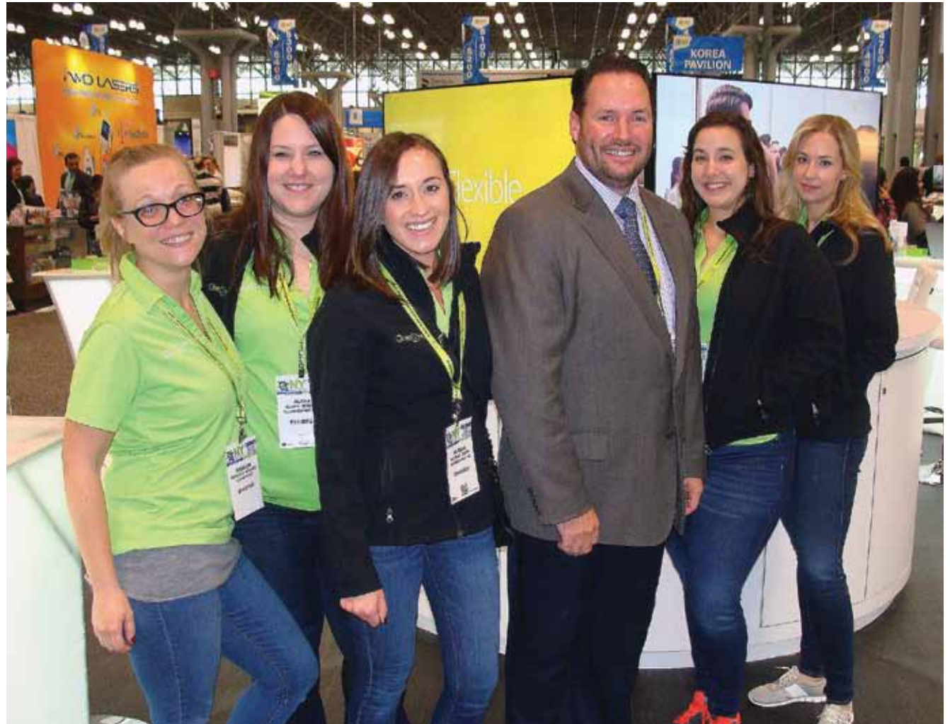
• The team from ClearCorrect (booth No. 5034).