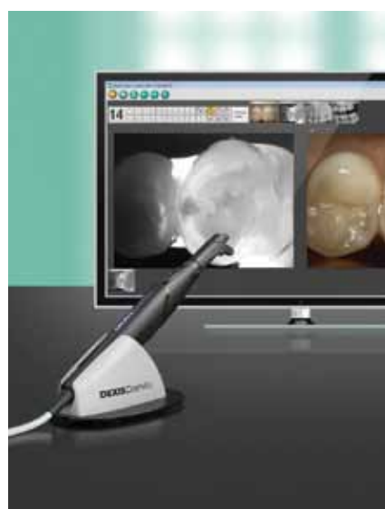
• The CariVu detection device.

To see the CariVu for yourself, stop by the DEXIS booth, No. 1802.