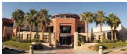
The Las Vegas Institute for Advanced Dental Studies.

As a patient, I expect the best care I can find. As a doctor, I want