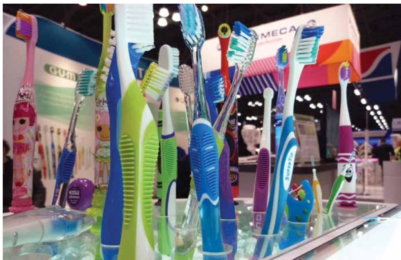
• Colorful arrays of toothbrushes welcome visitors to the Sunstar Americas booth (No. 3828), which is offering all sorts of show specials.