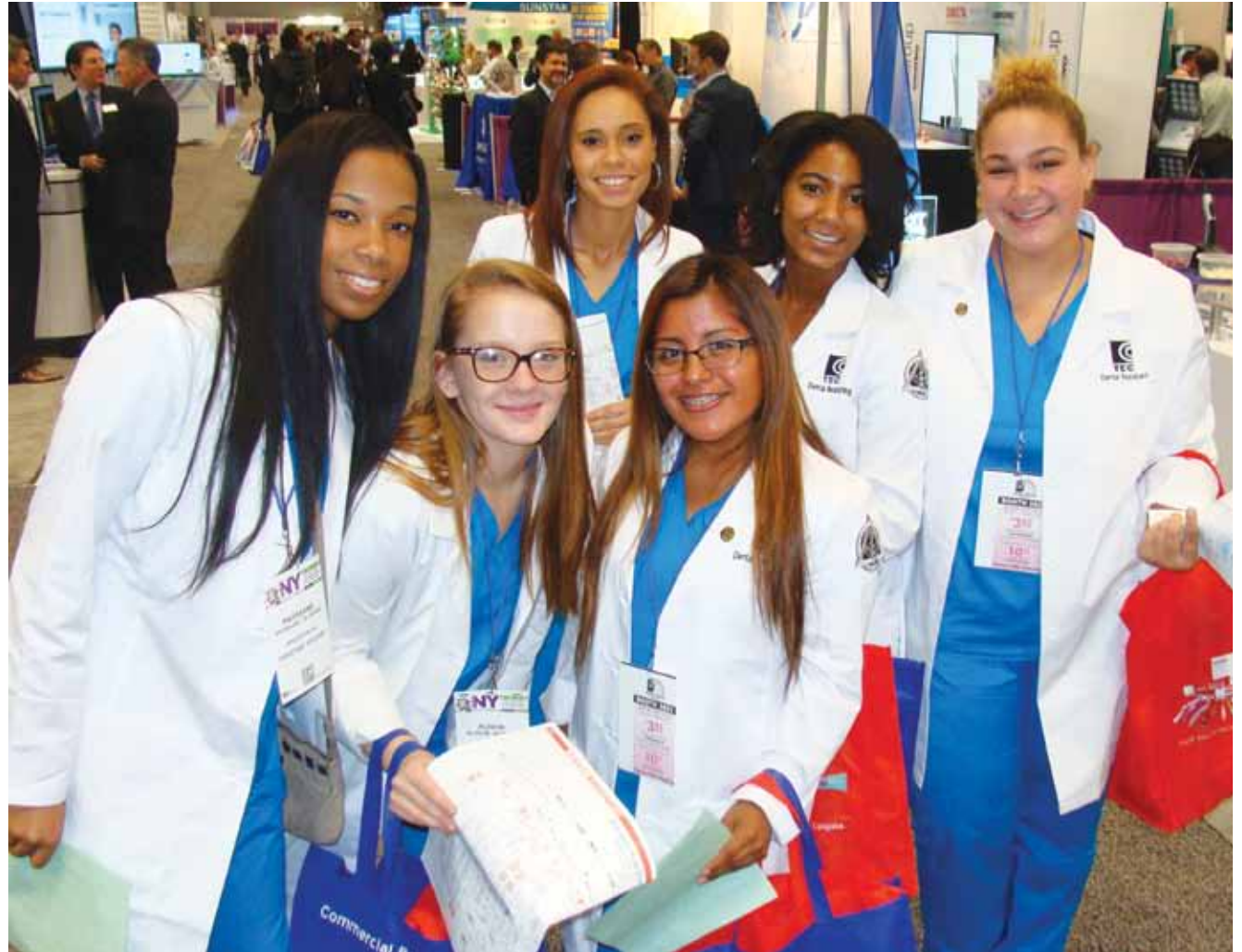
• These local students are taking a break from their dental assistant program studies to learn and explore here at the New York meeting.