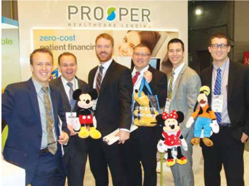
• The folks at Prosper Healthcare Lending (booth No. 5626) show off some of the plush Disney characters available to practice owners who sign up for patient financing programs.