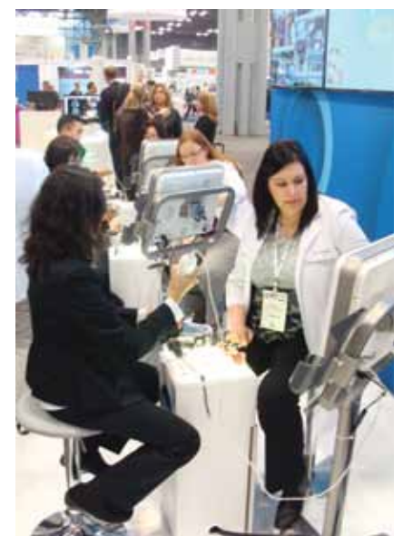
• Meeting attendees get hands-on training at the Invisalign Itero booth (No. 5205).