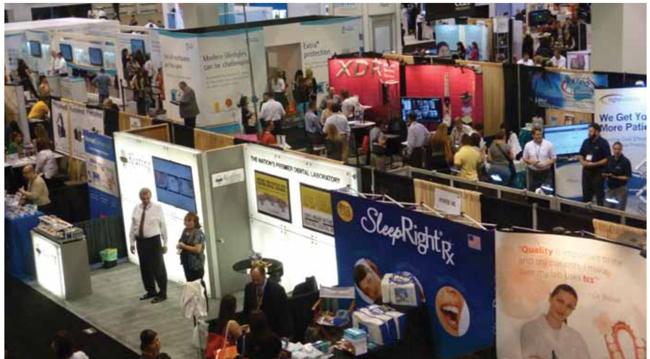
»see LAUNCH, page 3