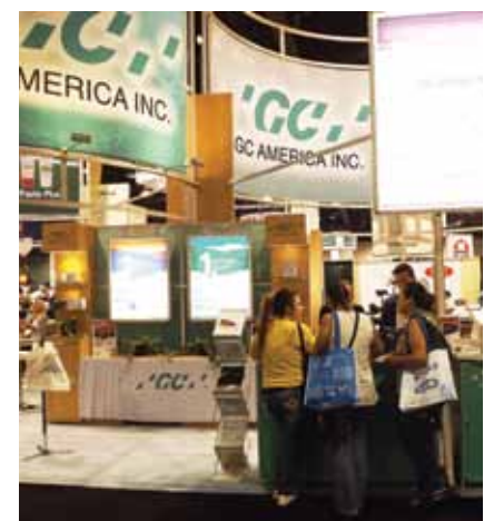
• GC America booth, No. 726, attracts attendees Thursday morning.