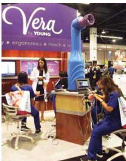
• Dental students try out the products at the Young Dental booth, No. 1430.