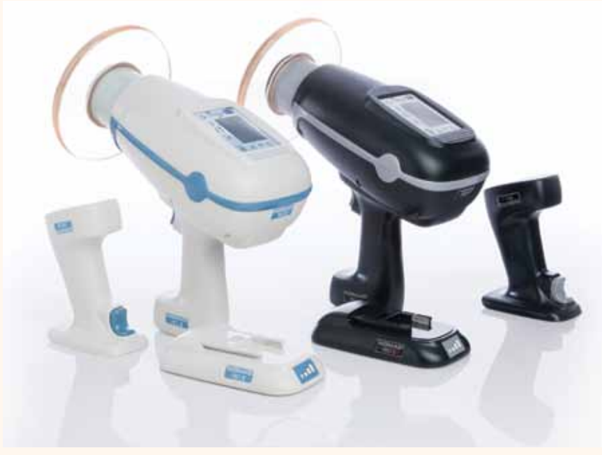
The NOMAD Pro 2.