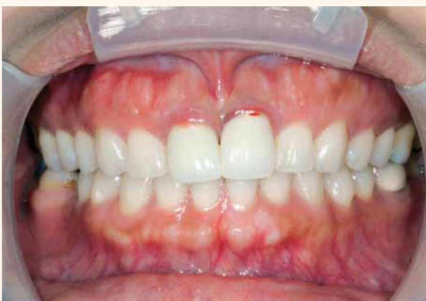
Fig. 1