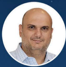
Antonis Chaniotis Greece