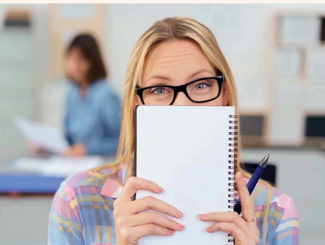
Over three-quarters of Brits believe poor oral health can hinder job applicants and their career prospects.