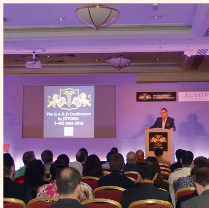
Prof. Paul Tipton addressing delegates.

The weekend catered for a broad spectrum of interests and the hugely positive remarks praised the high standard and wide range of topics, exhibitors and speakers, as well as the superb social event. Delegates were inspired to go back to their surgeries and incorporate what they had learnt, buzzing about the next conference. Preparations and talks for the 2017 BARD Conference