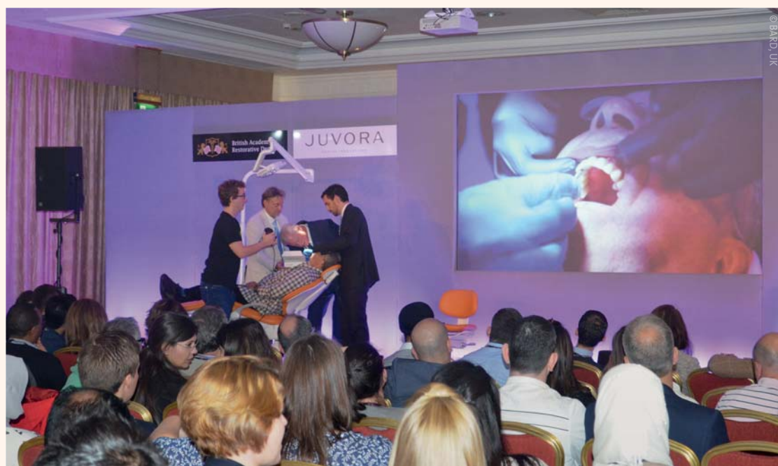
Live patient demonstration was a highlight of the latest BARD conference.

After a successful first day, the programme focus changed to new ideas and materials, with presentations on high-performance PEEK polymer and its uses, CEREC and the digital world, occlusion, dealing with and promoting oral health via the media, the Biofunctional Prosthetic System, comfortable dentistry for the clinician as well as the patient, and treating