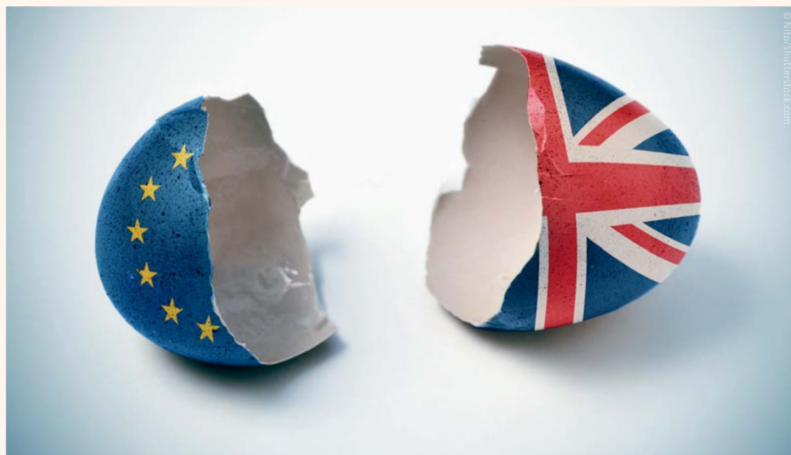
The majority of British voters in the referendum has decided to split from the European Union.

UK dentistry is directly affected by EU legislation in a num-