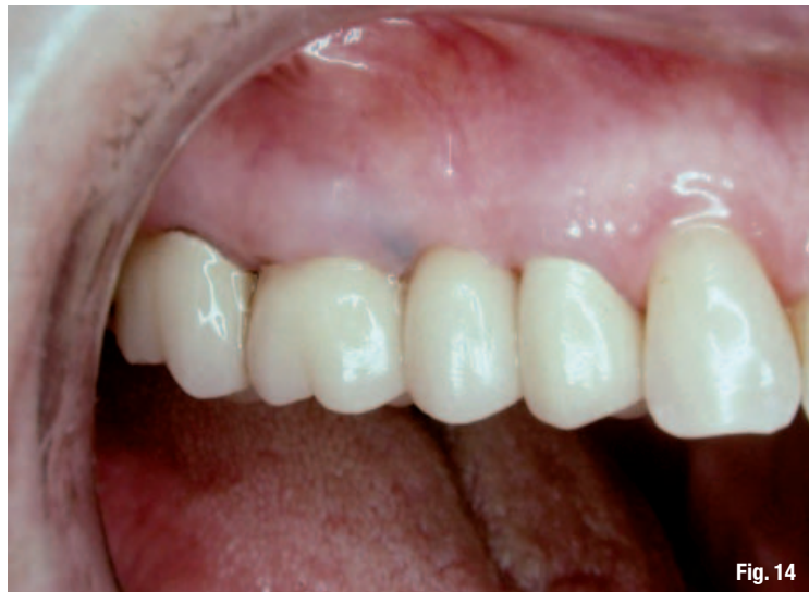
Fig. 14 With final prosthesis in place.

The second case demonstrates the use of the same technique in the posterior segment of a patient's maxilla. An extreme buccal-incisal defect (Figs. 10 & 11) where an extraction was done is shown in a maxillary posterior area (Fig. 12). The soft-tissue ridge augmentation technique was used. A temporary provisional bridge shows the restored ridge enhancing the cleanliness and cosmetic appearance. The final prosthesis displays a prosthetic appliance