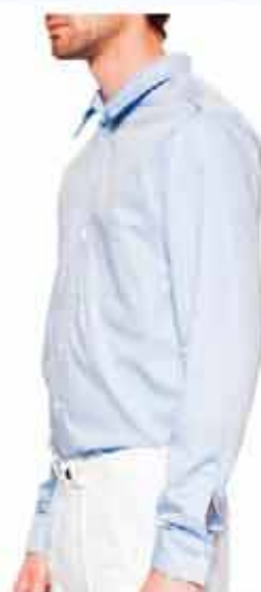
Sugar blue SLS113H/blue