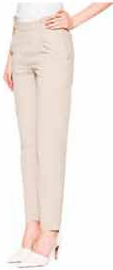
Basil olive PALS4113W/olive