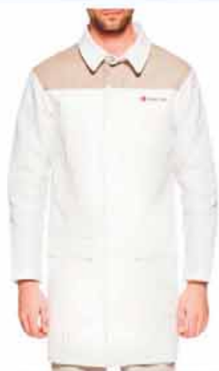
Mace white SPO02113W/white