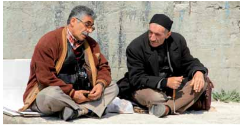
The prevalence of edentulism among elderly Turks is very high.

I think for the near future it is more important to distribute the potential dental work-force throughout the country more equally and to train people better to seek oral health care services before presenting with symptoms of oral disease.