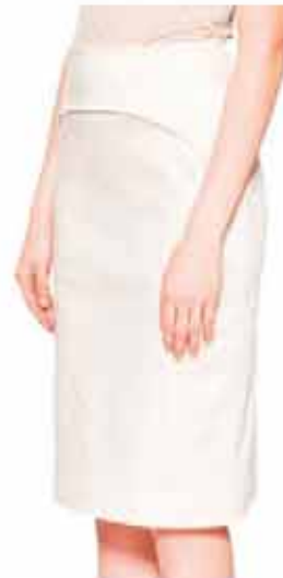
Seed oyster white SKD2117W/oysterwhite