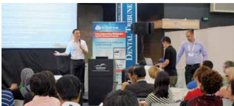
A full symposium at last year’s AWDC in Hong Kong.

For the fourth time, Dental Tribune International (DTI) will be bringing its Dental Tribune Study Club Symposium to the Annual World Dental Congress of the FDI World Dental Federation. The expert lecture series, to be held alongside the FDI’s scientific programme on the exhibition floor in the Istanbul Congress Center, will be supported by dental manufacturers SHOFU, Kerr and COLTENE, and feature clinical experts, who will