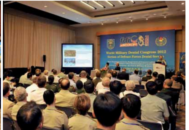
Delegates to the World Military Dental Congress listening to a presentation in the year 2012.