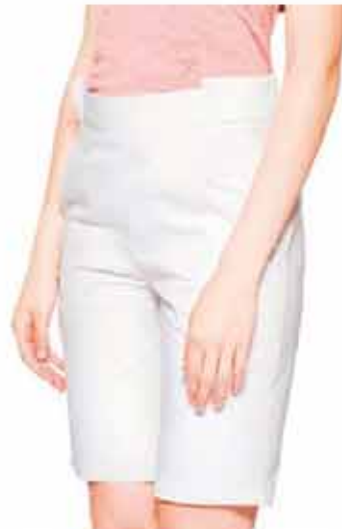
Chili white PALS1113W/white