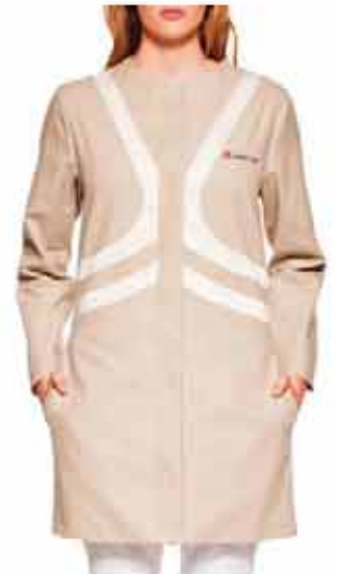
Lemon quarz grey SPO03113W/quarzgrey