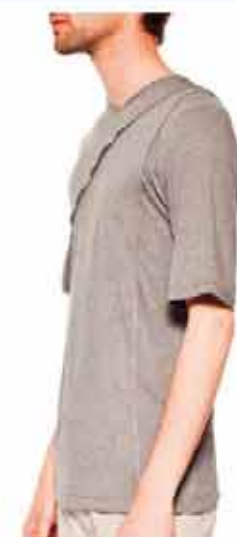
Apple grey TEE102113H/grey

EXPERIENCE AND FEEL OUR ENTIRE COLLECTION AT BOOTH B32/B66