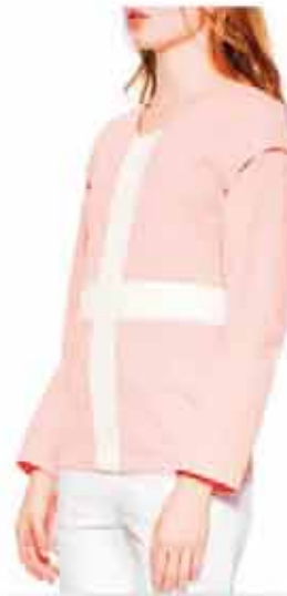
Chili apricot TOP1301111W/apricot