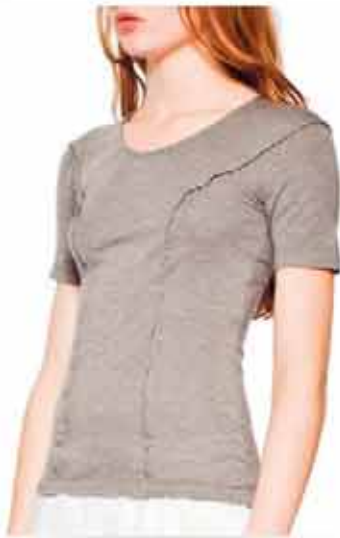
Nutmeg grey TOP15901113W/grey