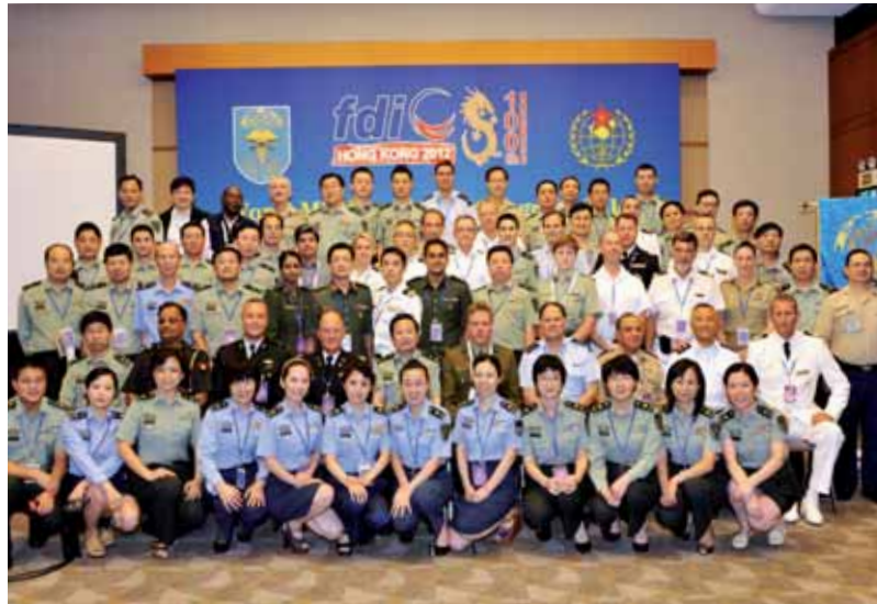
The SDFDS is welcoming new delegates from countries like Afghanistan this year.

In addition, management of dental service delivery, including performance assessment and improvement, readiness, dental management programmes, oral and maxillofacial treatment, as well as CAD will be in focus.