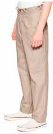
Tea quarz grey PALS1113W/quarzgrey