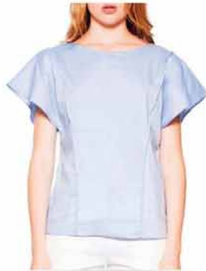
Lavender light blue TOP5901113W/lightblue