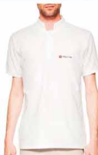
Sesam white POL02113H/white