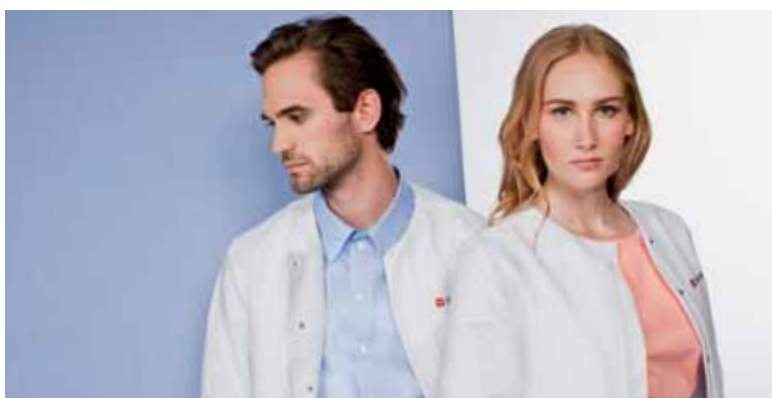
The latest in clinical apparel will be presented by new fashion label CROIXTURE on Wednesday.

Latest concepts and technologies in dentistry presented by DT Study Club FDI symposium