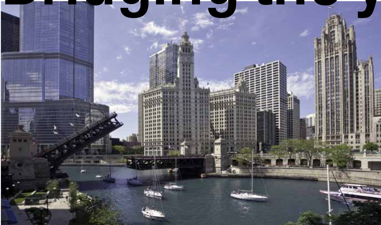
• A bridge opens over the Chicago River.

The 149th Chicago Midwinter Meeting expands on your past education to help lead you into the future of dentistry