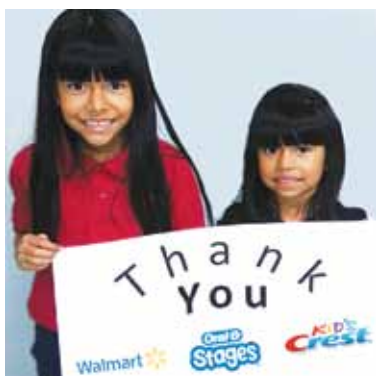
• America's ToothFairy Smile Drive promotes family oral health.

■ Designed to raise awareness and collect oral care products for at-risk children and teens, the America's ToothFairy Smile Drive is being held this month, which is National Children's Dental Health Month.