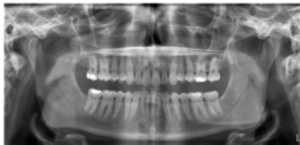
ProMax S3 Standard Adult Pan - From Same Patient As Bitewing