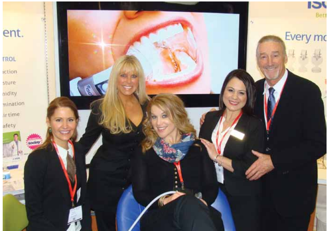
• The gang at Isolite (booth No. 709).