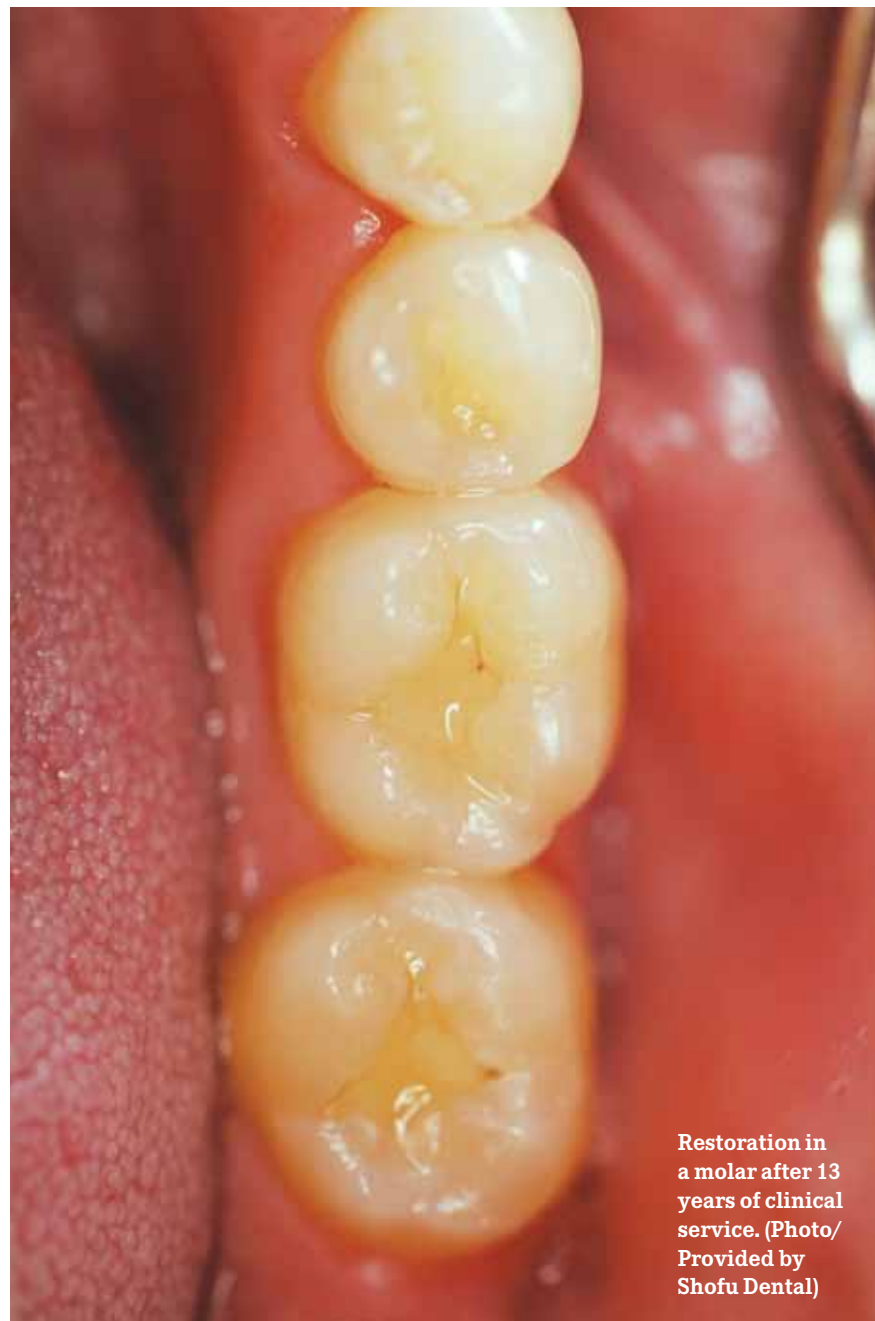
Restoration in a molar after 13 years of clinical service.

• BEAUTIFIL Flow Plus: A flowable base, liner and final restorative approved for all classes (I-V). Physical properties rival leading packable composites. With handling that is