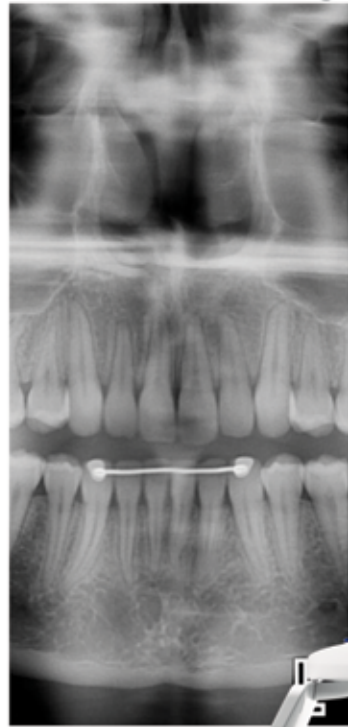
ProMax S3 anterior PA Image