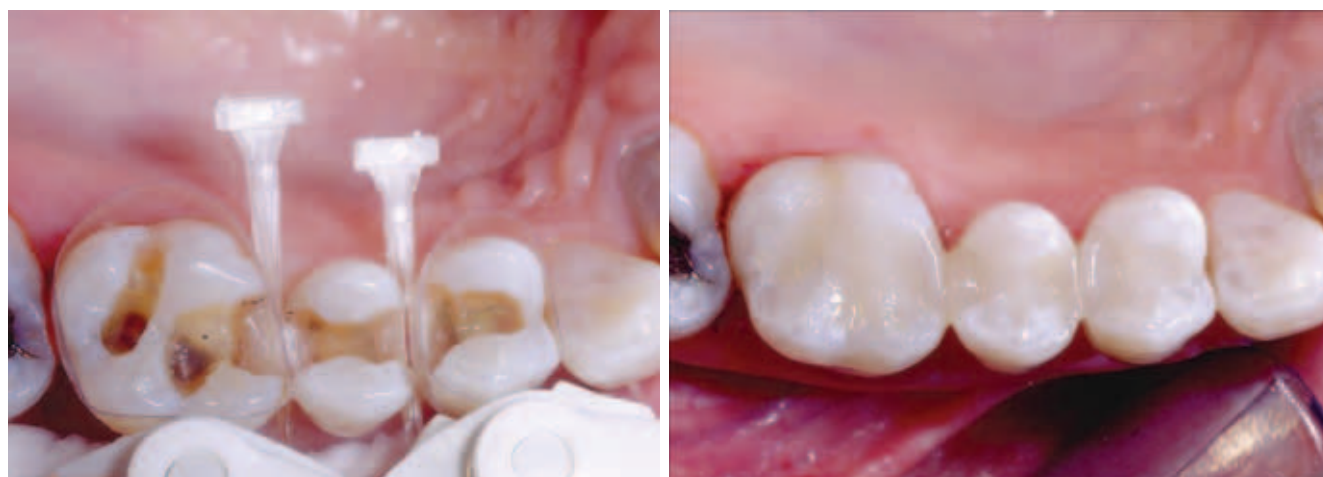
• Functional and naturally beautiful restorations created with Beautifil II LS.

Highly filled, 83 wt percent, Beautifil II LS demonstrates excellent compressive and flexural strength (ca. 370 MPa and 120 MPa, respectively),