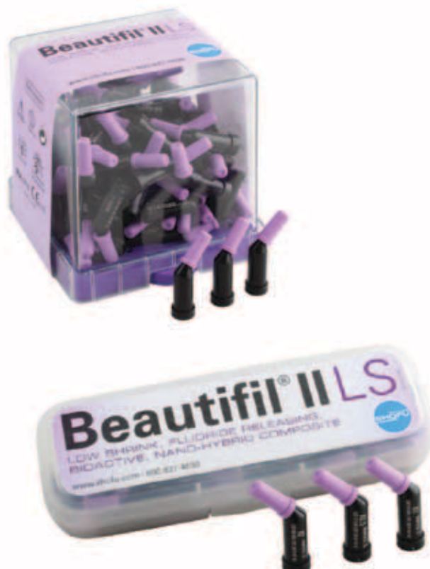
• Beautifil II LS.

maintains ideal color stability and polishes in an instant, producing a long-lasting sheen, according to the company.