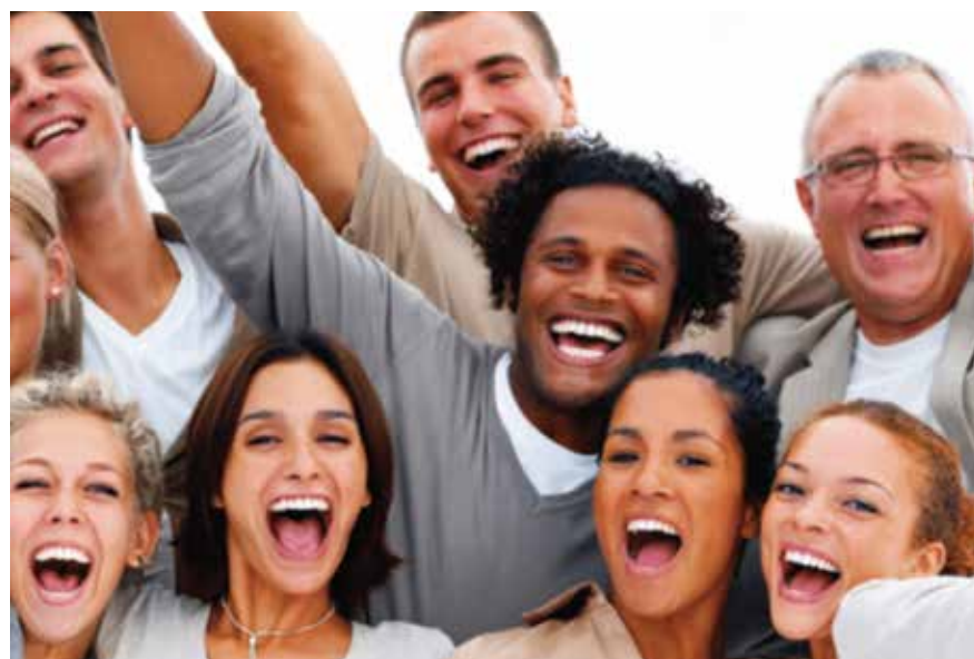
• These happy patients can be yours.

As patients have more and more choices for their dental care, don't lose a single patient because they fear coming to you. Give them the experience that keeps them coming back for years.