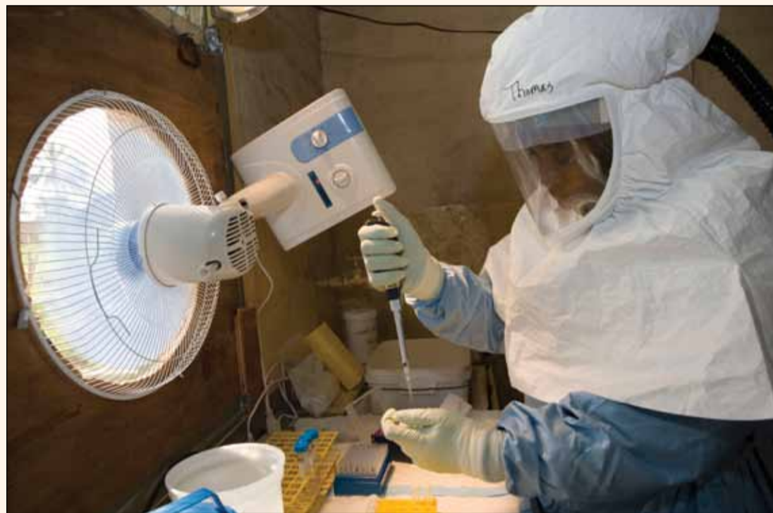
A laboratory worker in the Democratic Republic of Congo does a test using a micropipette. Quick on-site laboratory diagnosis enable the World Health Organization response team to precisely diagnose new suspected Ebola patients within two to six hours.

In dentistry, we are constantly exposed to these emerging and re-emerging infectious threats and we cannot afford to let our guard down. Vigilance, awareness and good clinical practice with standard infection control at all times are fundamental to prevention, as yet-unimagined new diseases surely lie in wait. Although we have made spectacular technical and scientific advances since the release of the original IOM report some two decades ago, it appears that humans are still defenceless in the face of the relentless march of our microbe foes. drug-resistant tuberculosis. D1