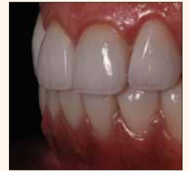
Fig 12. One month recall, Close-up front picture, showing the improvement in the interdental papilla and the relative translucency level with the lower set