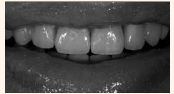
Fig 11a.11b. The glamor smile right after cementing the second set of veneers, and using the polishing rubber heads (Optrafine, Ivoclarvivadent)