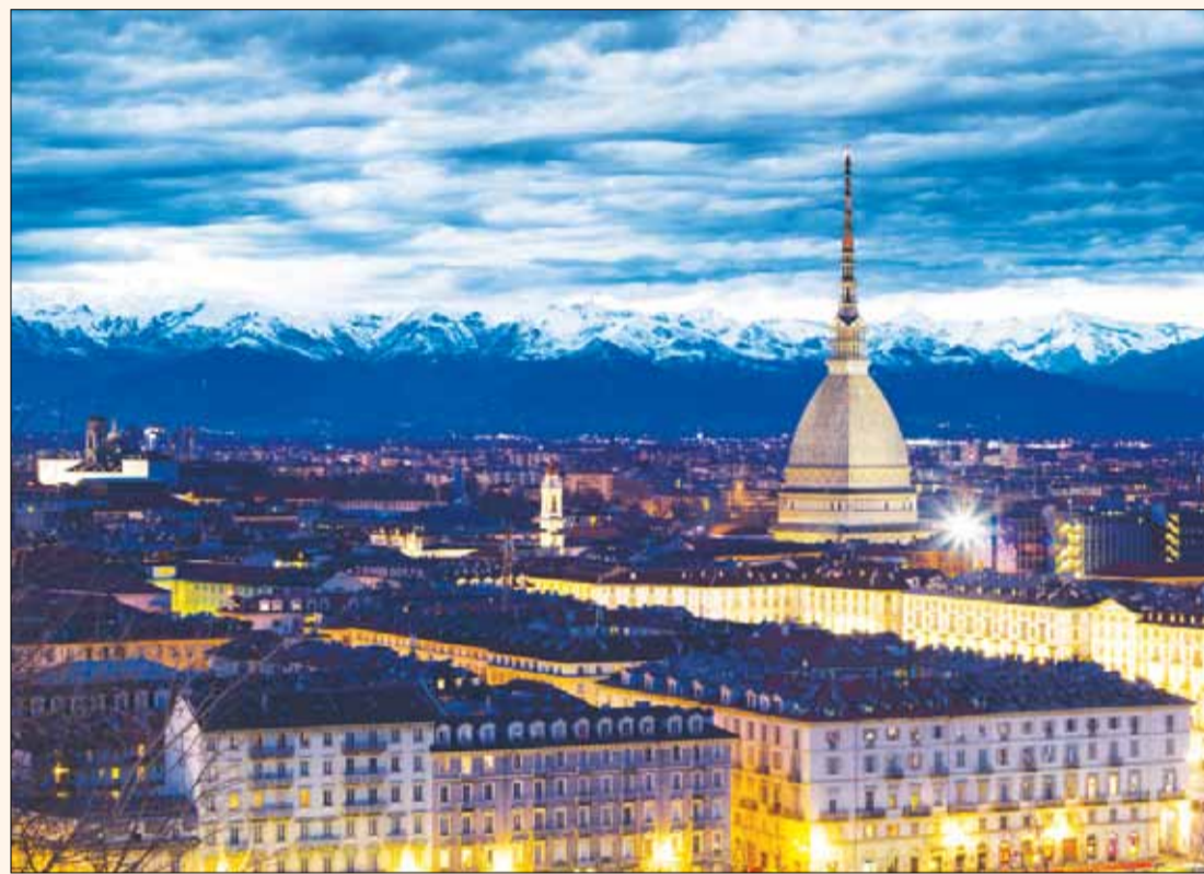
Turin with Mole Antonelliana and the Alps in the background.