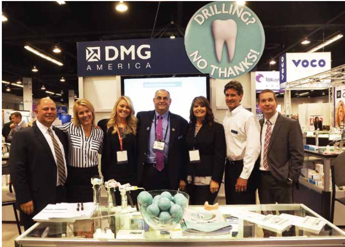
• The cheerful crew at DMG stand ready to help attendees at booth No. 446.