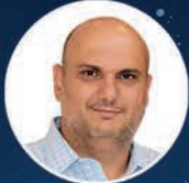
Antonis Chaniotis Greece