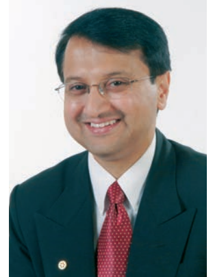
Dr Sushil Koirala