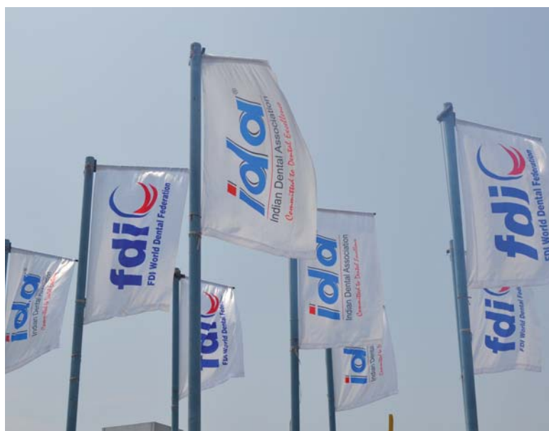
This year's AWDC is organised by the FDI in partnership with the Indian Dental Association.

It is the second time that India is hosting the prestigious dental event