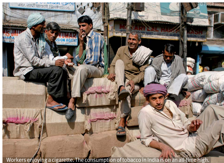
Workers enjoying a cigarette. The consumption of tobacco in India is on an all-time high.

As the available treatment centres are mainly located in the cities and have very few resources, patients