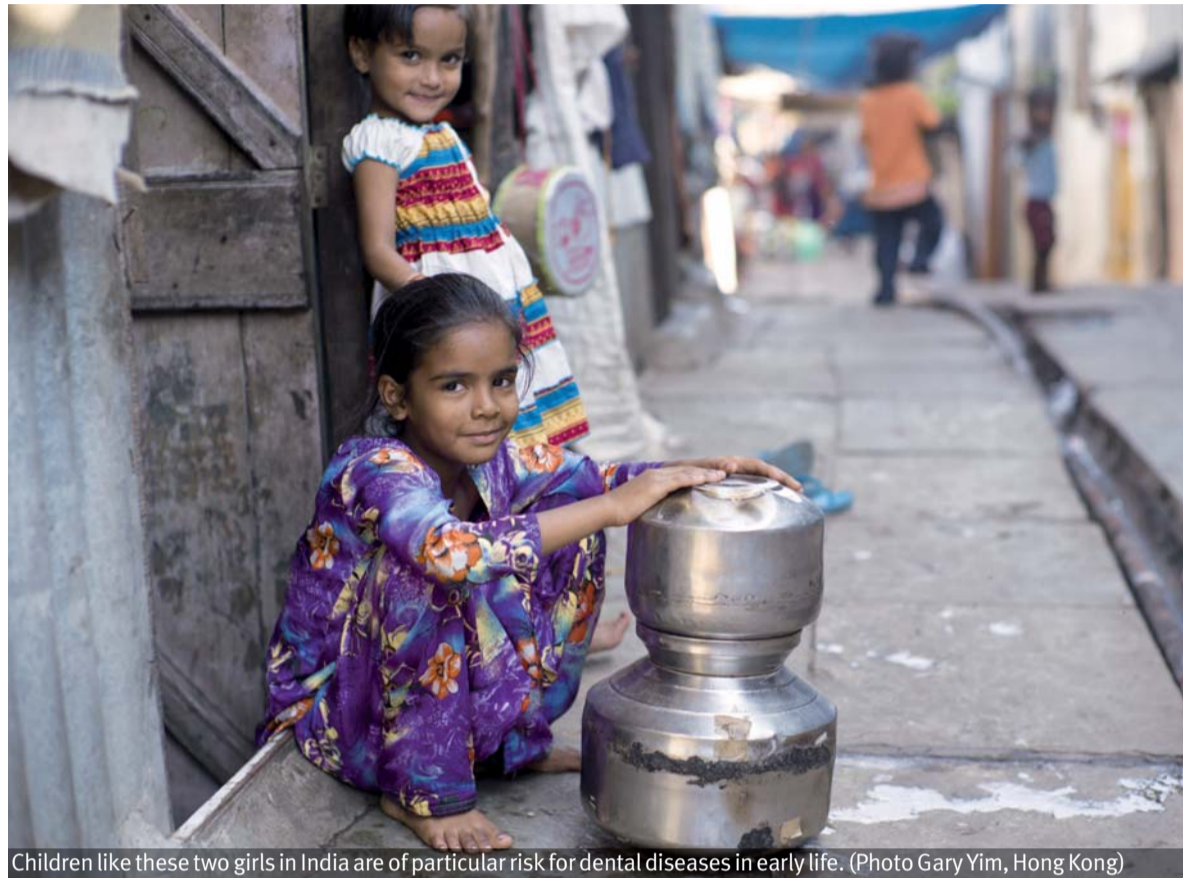
Children like these two girls in India are of particular risk for dental diseases in early life.

ECC is transmitted from the parent or caregiver to the child and, if left untreated, can lead to infection and severe pain. As a consequence, children can experience difficulties in eating and speaking, which will have an effect on their readiness for school and their overall quality of life. Most dentists, unfortunately, tend not to see children before they have reached the age of