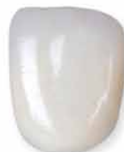
Final BruxZir® or IPS e.max® crown included