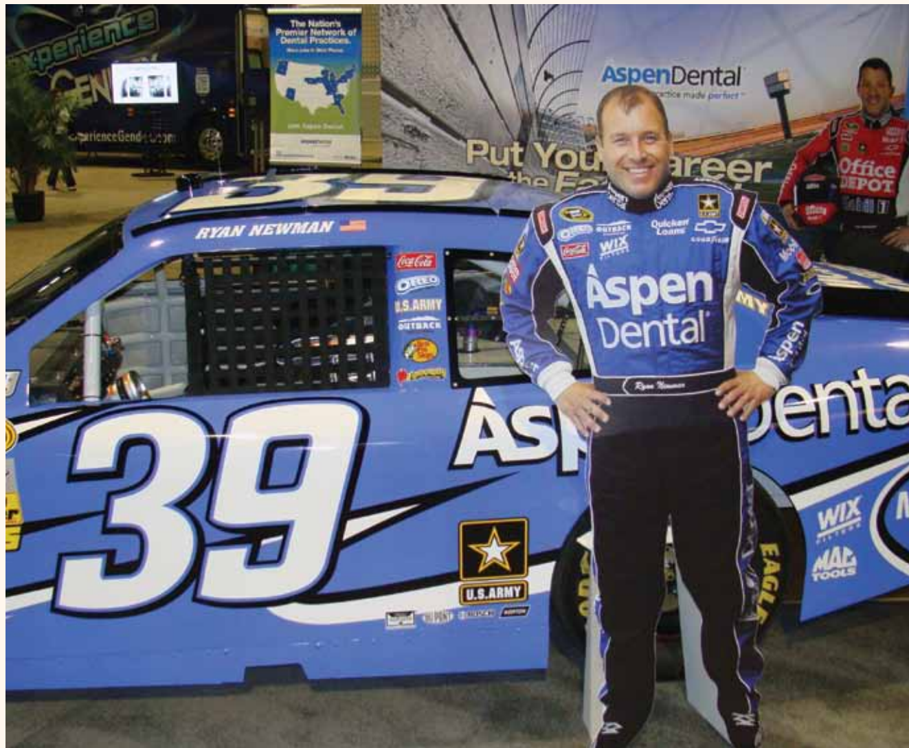
Get your picture taken with auto racing's Ryan Newman at the Aspen Dental booth (Nos. 2729/2733).