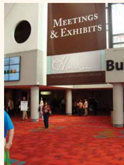
It's this way to the meetings and exhibits.