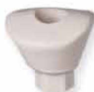
Custom healing abutment included