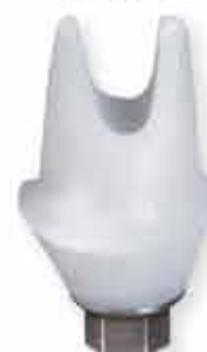
Final custom abutment included