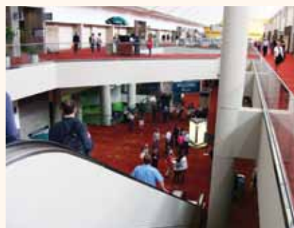
During the Hinman meeting, there's always plenty more to see and explore at the Georgia World Congress Center.