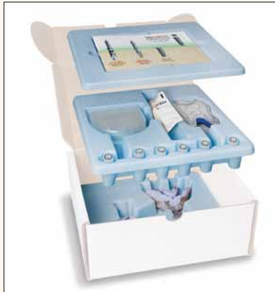
Fig. 1: Inclusive Tooth Replacement Solution