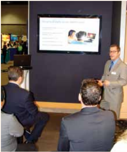
Attendees sit down for an educational presentation offered at the Carestream Dental booth (No. 1323).