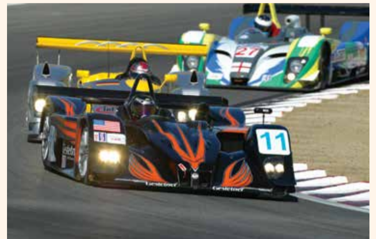
Fig. 3. Steve Knight at Laguna. In racing, perfect driver ergonomics is critical. Knight's Goldilocks theory applies to a dental practice using existing seating simply because it was already there. Sometimes it's too tall or too short, and no matter how much it is adjusted, it is still not just right.

A recent success story illustrates the difference checklists can make in medicine. The intensive care unit (ICU) at a hospital is a crucial part of health care delivery and one of the