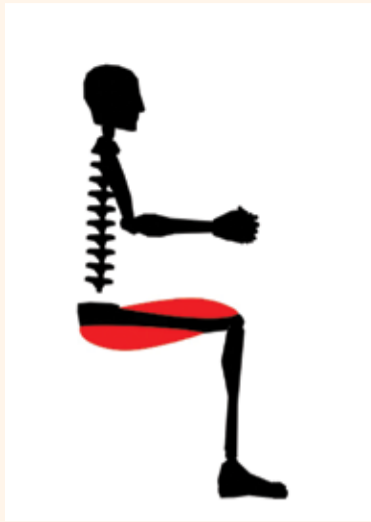
Fig. 4. Traditional upright seating: Notice how this causes a stretching in the thigh muscles.

Hospital checklists are saving lives and money. Pilots use several different checklists for every flight to prevent pilot error and crashes. Winning race car teams and race car drivers use checklists for every race. Dentistry can use checklists to great benefit as well. We've come a long way, yet dentistry still has a way to go. It won't happen without a change of culture. First, the problem must be recognized, hopefully before there is