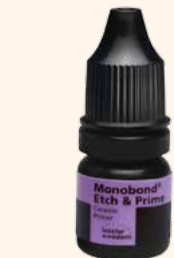
Fig. 1: Monobond Etch & Prime has already won over many users