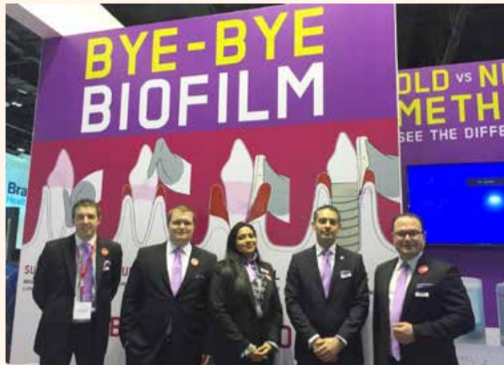
EMS booth team