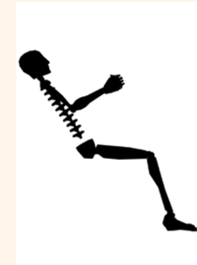
Fig. 5. Reclined seating