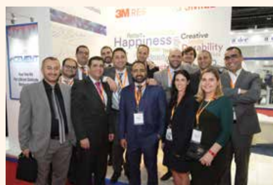
Fig.2. 3M Oral Care Team at AEEDC

For more information please visit www.3MGulf.com/espe