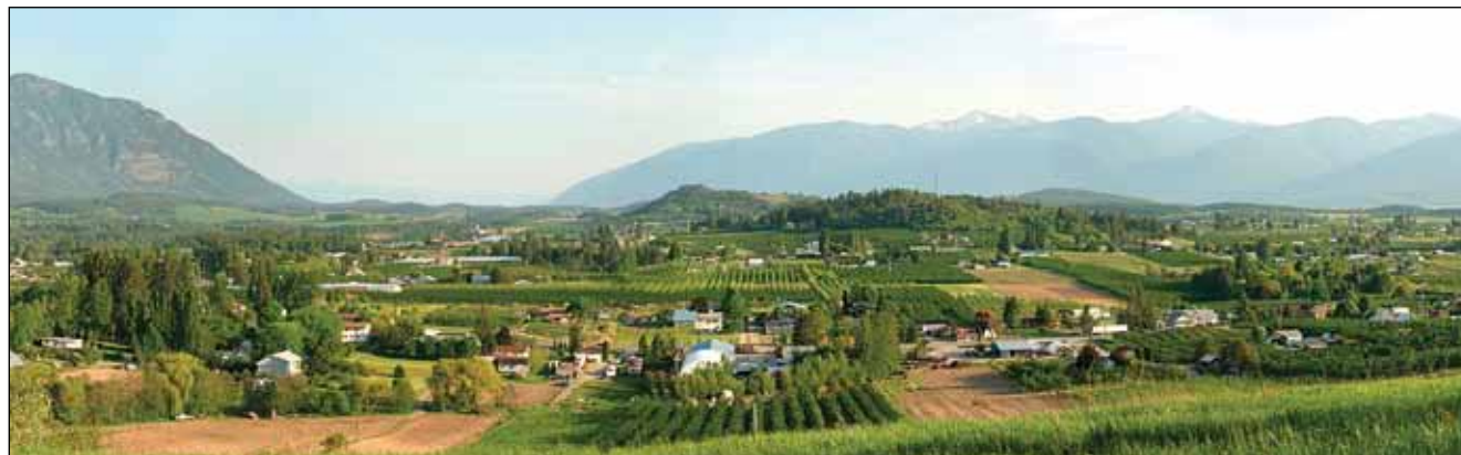
• Creston Valley, British Columbia, wants a general dentist to set up a practice in the idyllic locale, shown here looking south across some of its vineyards and orchards. The town's population is more than 5,300; the entire valley's is about 16,000.