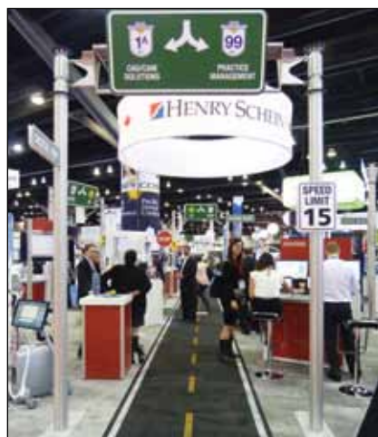
• The always-colossal Henry Schein booth debuts its traffic-control theme (No. 709) at the PDC, making it easier to find the company's many services and products.