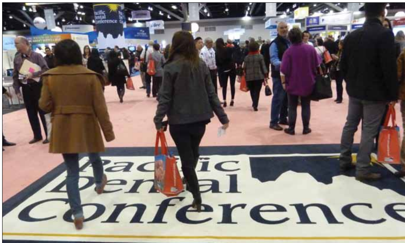
• Attendees stream into the Exhibit Hall on Thursday to enjoy lunch, watch the Live Dentistry Stage session and check out the dental industry’s latest products and services.