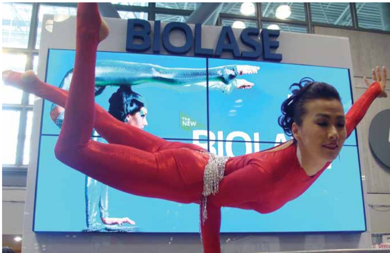
• A contortionist from Cirque du Soleil performs at the Biolase booth (No. 600) Sunday morning, to help celebrate the launch of the company's Epic X laser. You can catch additional performances between 11 a.m. and 2 p.m. today, at the top of each hour.