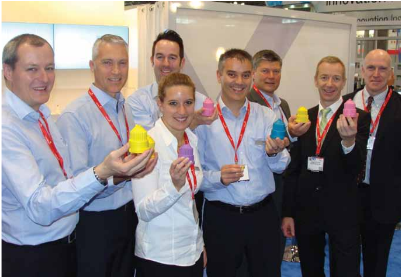
• Everyone at Sulzer MixPac (booth No. 4822) has a 'stress ball' modeled after the company's trademarked MIXPAC mixing tip.