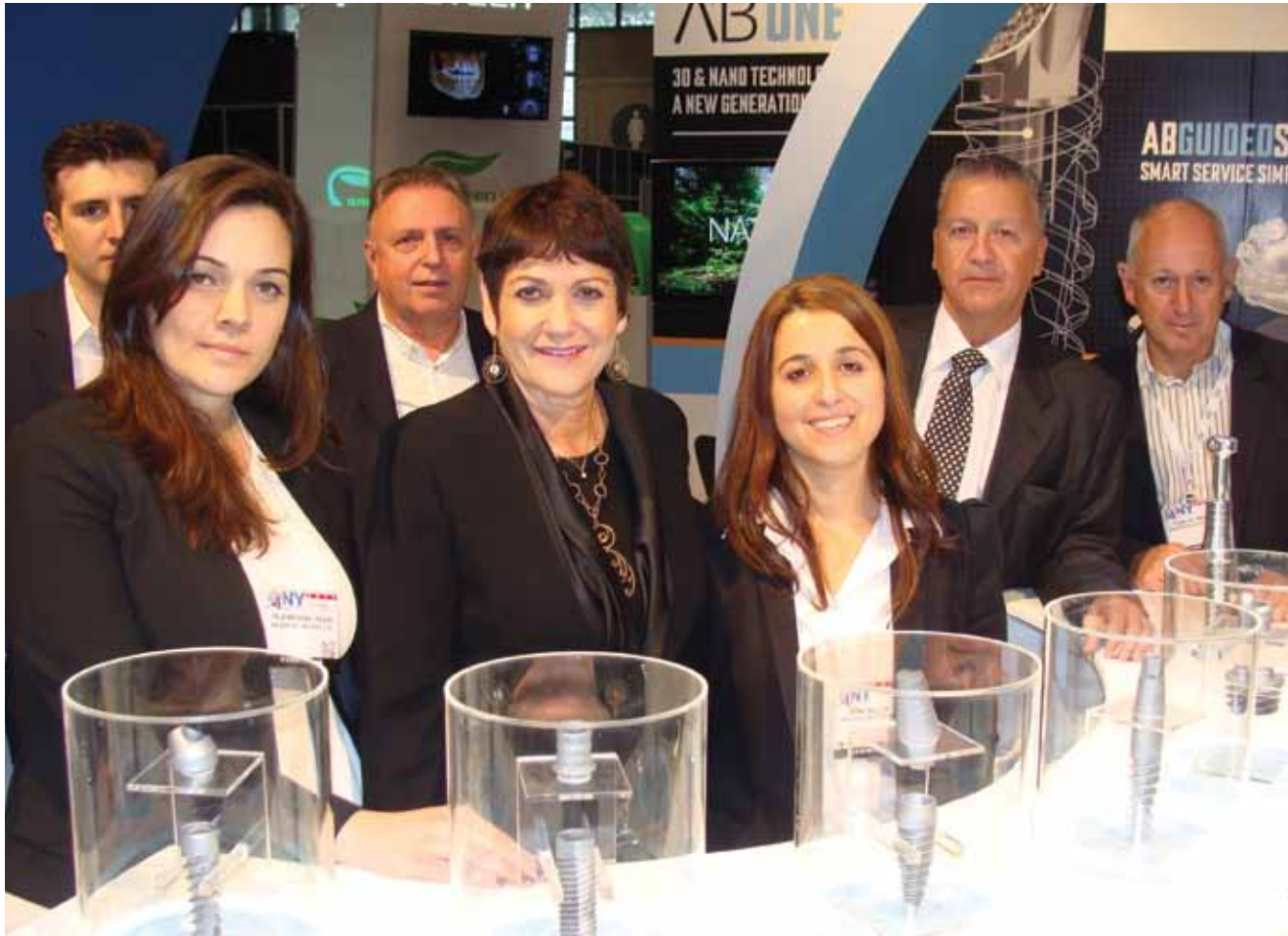
• The folks at A.B. Dental Devices (booth No. 5411).