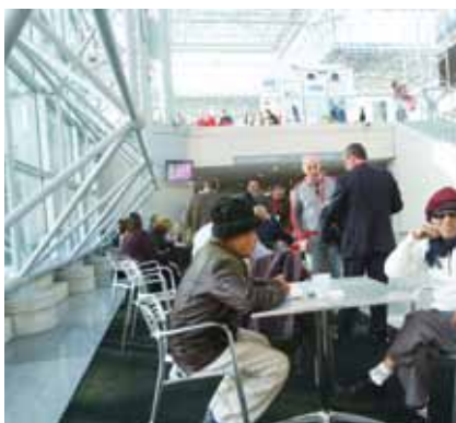
• Show attendees find respite at the tables down by the Javits entrance after a long, full day at the Greater New York Dental Meeting.