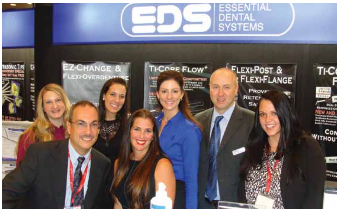
• The gang at Essential Dental Systems (booth No. 2003).