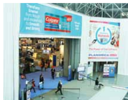
• Left, the Greater New York Dental Meeting knows how to make an entrance.

• Meeting attendees stroll the aisles of the exhibit hall Monday afternoon.