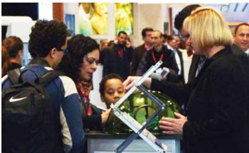
• An attendee takes advantage of the opportunity to test drive the Epic diode laser at the BIOLASE booth, No. 600.