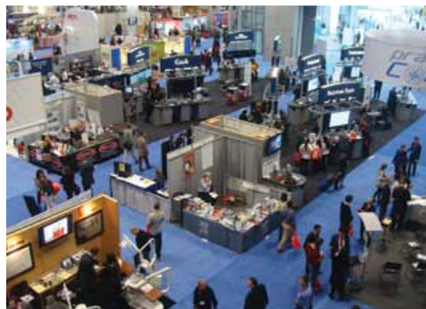
• The exhibit hall floor, as seen from above, is alive with activity Monday afternoon.