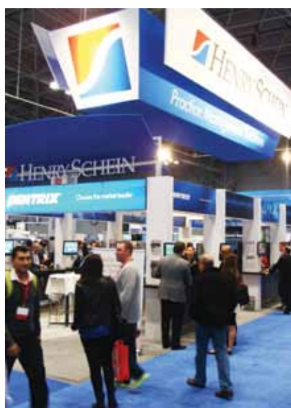
• The Henry Schein booth (in the 4000 aisle).