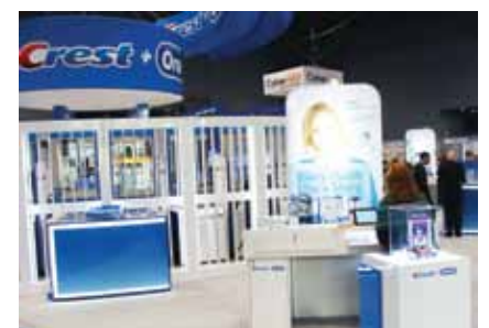
• The Crest Oral-B booth (No. 1226).