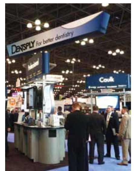
• A crowd gathers at the DENTSPLY booth, No. 2600.