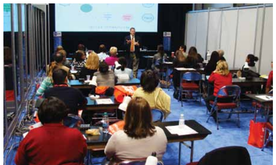
• Meeting attendees learn about technique in a glass classroom presentation on the exhibit hall floor.