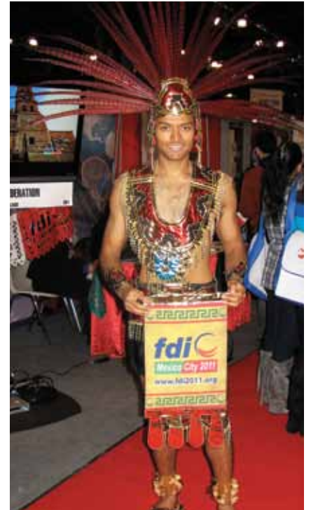
• A vibrant visual reminder for the FDI meeting, which will take place in Mexico City next year.