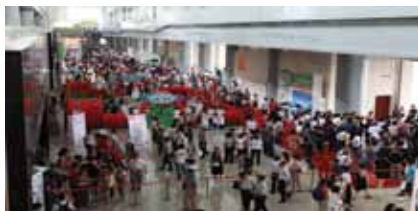
■ Inside the 2010 Sino-Dental meeting, held at the National Conventional Center in Beijing.

ulation and its modern convention center, the 2010 meeting included more than 600 exhibitors from 20 countries. Most notable was the large increase in exhibit space. The event featured cutting-edge technology and both foreign and domestic products, materials and instruments.