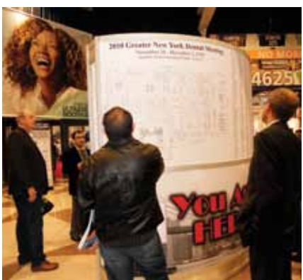
• GNYDM attendees check out the large map detailing where everything is located before venturing into the enormous exhibit hall featuring more than 1,500 exhibit booths.