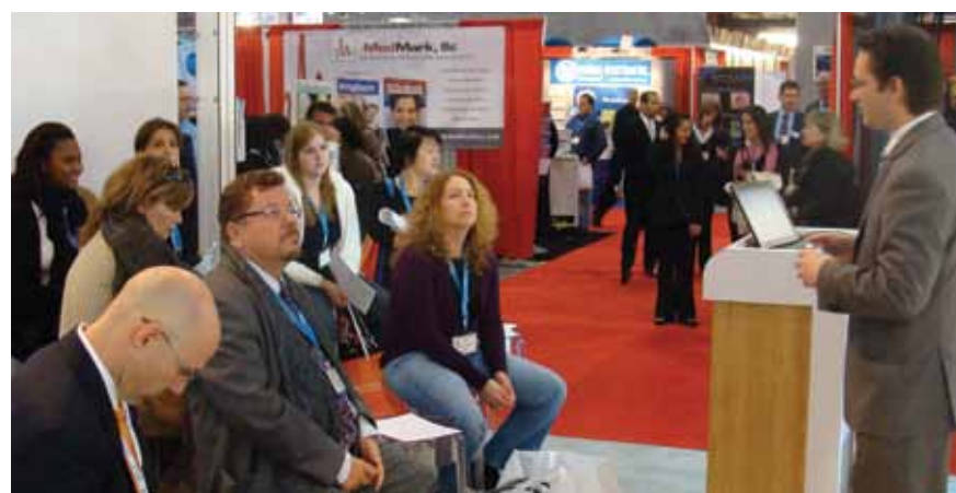
• Dentists listen to a lecturer at the Invisalign booth (No. 4420).