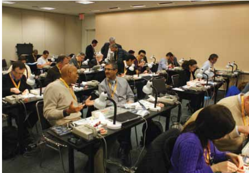
A variety of endodontic workshops and seminars will take place today, Tuesday and Wednesday.

Today, Musikant will present two half-day workshops. These hands-on tutorials will introduce endodontic