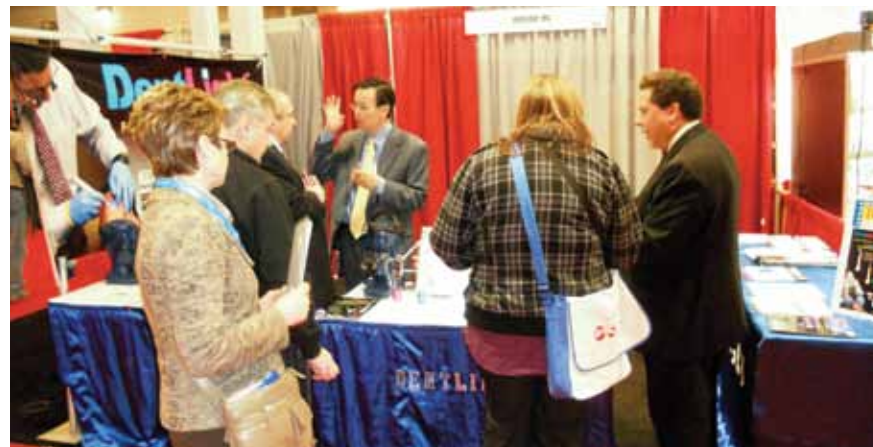
• DentLight designs, develops and manufactures a variety of detection and treatment devices, particularly LED lighting-based dental equipment such as curing lights, headlights and loupe lights, exam lights and loupes. To learn more, stop by the booth (No. 2629).