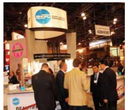
• A crowd gathers at the Shofu booth during Sunday's exhibition, likely to hear more about the company's award-winning products, such as BeautiBond and Beautifil.