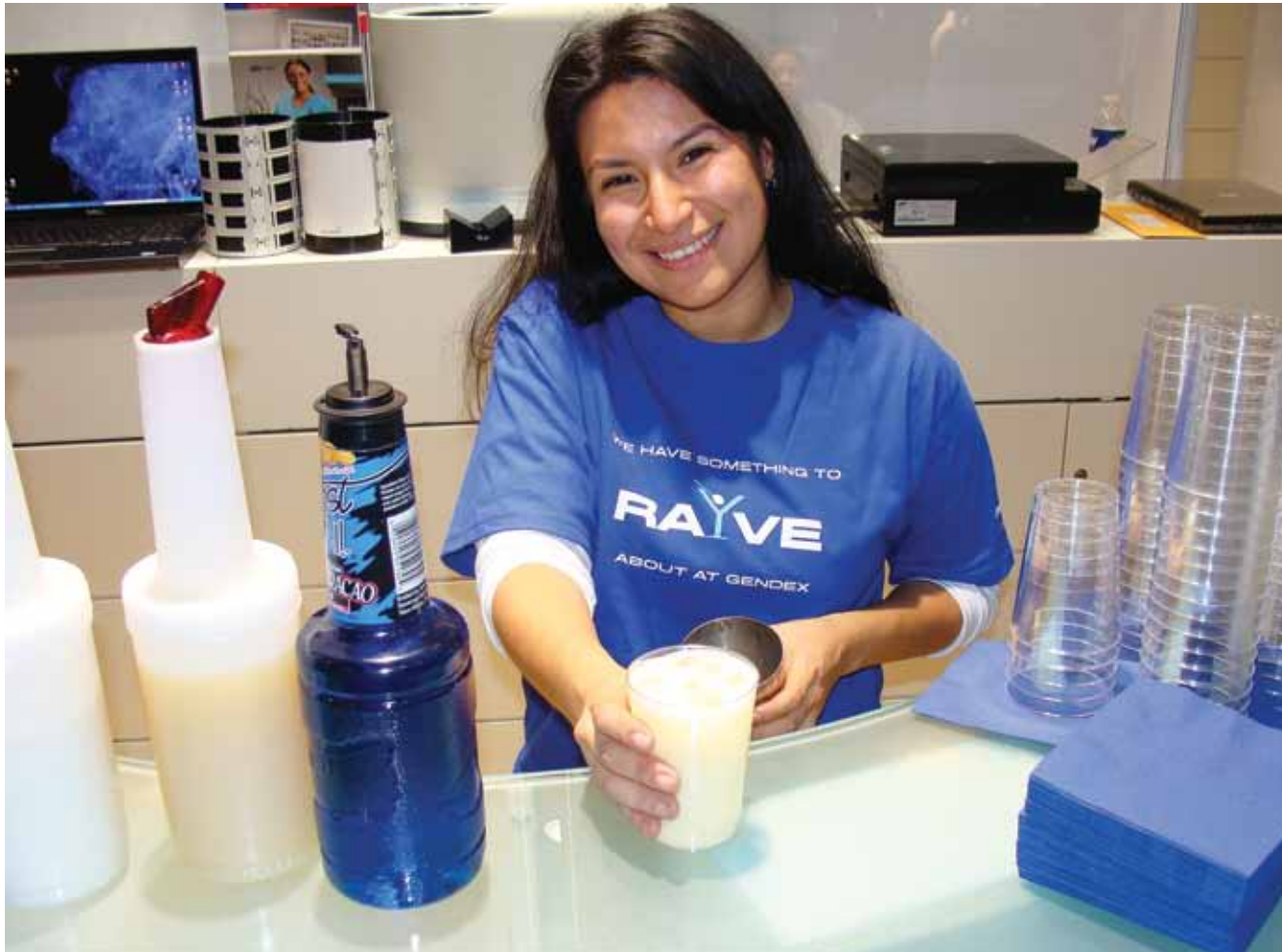
• A bartender serves up drinks (the non-alcoholic kind) at the Gendex booth, No. 4017.