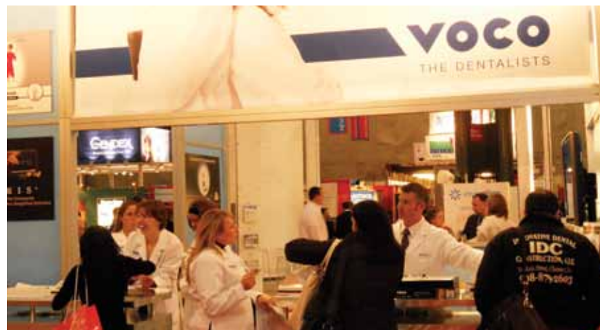
• Attendees stop by the VOCO booth (No. 4623) to hear about the company's new products, Curvy (anatomically shaped interdental wedges) and Dimanto (a diamond polisher that works with all composite materials).