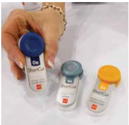
• Dux Dental (No. 4215) just introduced ShortCuts, the all-in-one retraction cord delivery system, available with Gingi-BRAID retraction cords inside.