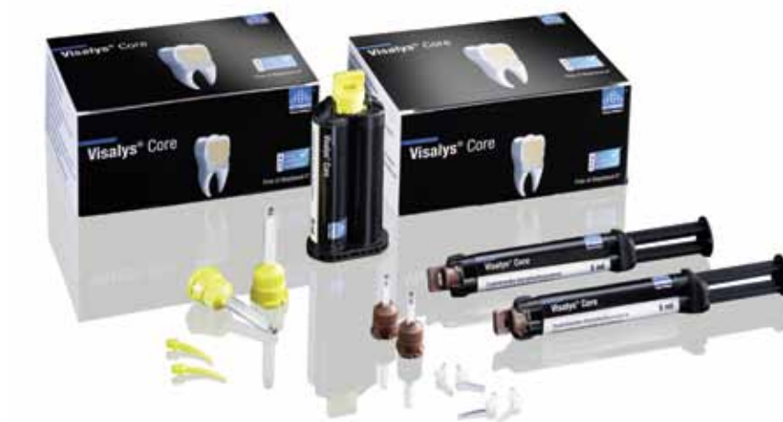
■ Visalys Core.

The product incorporates ACT, which is unique in the market. This enables the material to bond actively with all common light-curing and dual-curing, single-step and multi-step adhesives, without an additional activator. The advantage for users is that it allows them to use the bonding agent they are used to – no matter whether it is a light-curing or