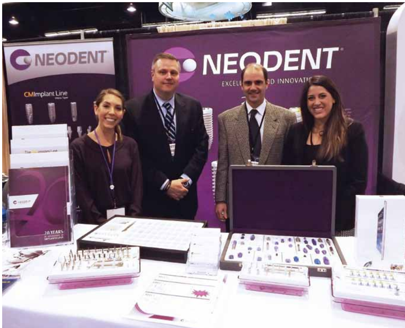
• The team at Neodent, booth No. 2340, stands ready to introduce attendees to the company's cutting-edge implant offerings. Here at the CDA, attendees can fill out a survey and enter to win an iPad Mini or they can purchase 50 products and get an iPad Mini for free! Stop by the booth to find out what's included.