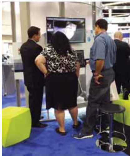
• Attendees learn all about the True Definition Scanner at the 3M booth, No. 302.