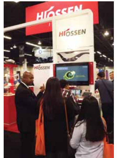
• To learn more about Hiossen's implant technology, stop by the company's booth, No. 2330.