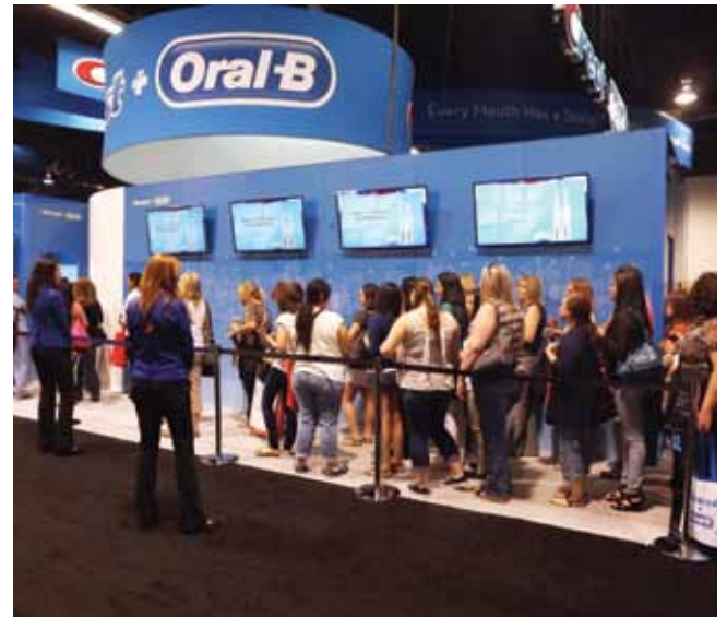
• Attendees line up to hear the latest from Crest Oral-B at booth No. 1106.