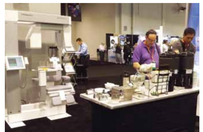
• Visit the KaVo Kerr Group booth, No. 1628, to learn more about the SOREDEX dental imaging system, and while you're there, have a cup of Starbucks coffee or tea.