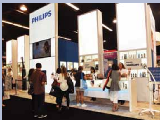
• The Philips Sonicare and Zoom Whitening booth, No. 2218.

• NiteWhite Maximum White : The most dramatic results for a healthy, white smile. Used over-