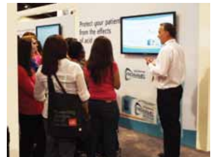
• Attendees learn how Sensodyne can protect patients from the effects of acid erosion at booth No. 2118.