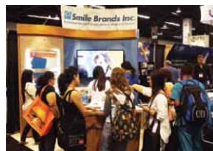
• A group of dental students visits Smile Brands booth, No. 2359.