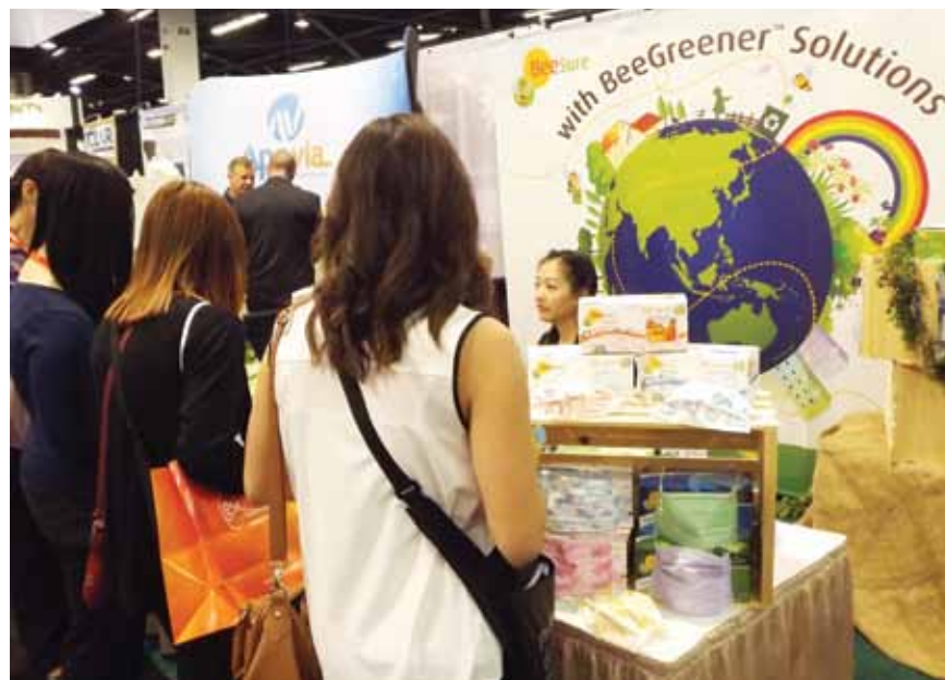
• A collection of brightly colored, chlorine-free and greener solutions can be found at BeeSure, booth No. 2335, including masks, gloves and tips.