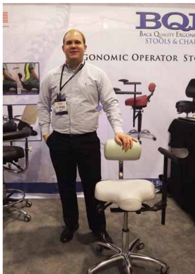
• Seeking seating solutions for your practice? Visit Brady Miers at BQE, booth No. 2334, and you can receive up to $200 off the retail price here at the CDA.