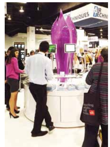
• PureLife, booth Nos. 312/709, which you may quickly spot by the giant, purple orchid bud in the center, says it seeks out products that are healthier for your patients, staff and the planet, so you don't have to sacrifice profitability to achieve responsibility.