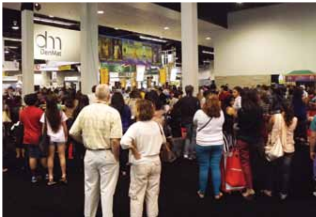
• CDA attendees line up to visit and get signatures from former L.A. Lakers and Clippers player Lamar Odom, L.A. Lakers champion Jordan Farmar and former L.A. Dodgers player Eric Gagne at the Glove Club booth, No. 832. If you missed them Friday, they'll all be back today.