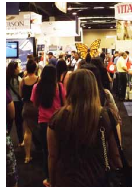
• CDA attendees follow a pair of monarch butterfly wings through several aisles of the exhibit hall, ending up at the Air Techniques booth, No. 416, where they learned more about the Monarch line of smart products to clean and disinfect the dental office.