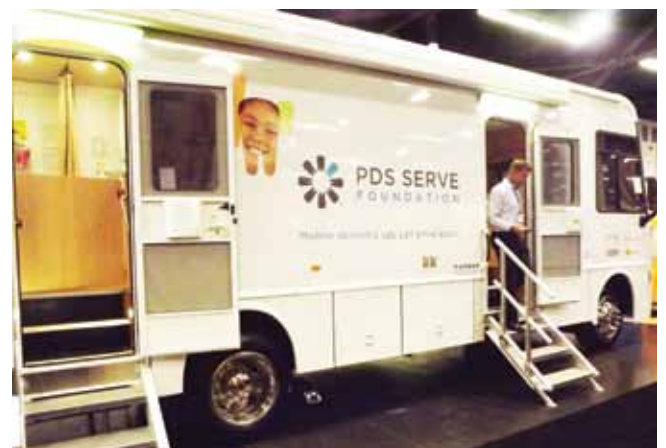
• Talk to someone about becoming an independent contractor and learn more about mobile dentistry with Pacific Dental Services at the custom bus at the end of the 2100 aisle.