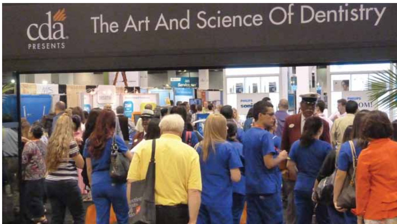
• Attendees head toward all four corners of the exhibit hall — and everywhere in between — as soon as the doors open on Friday morning.