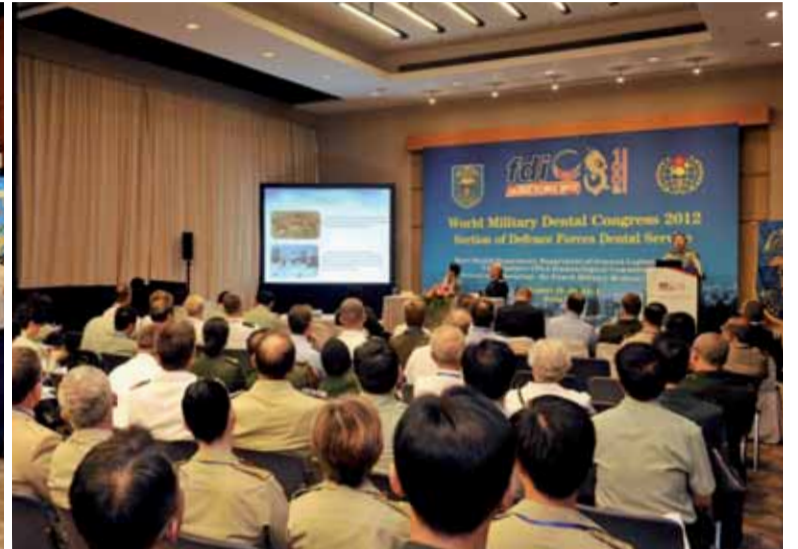
Delegates to the World Military Dental Congress listening to a presentation in the year 2012.