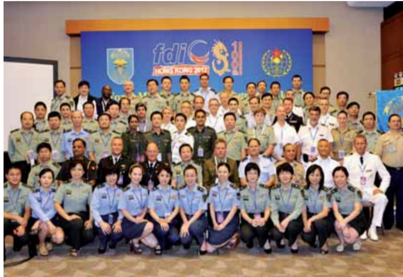
The SDFDS is welcoming new delegates from countries like Afghanistan this year.

In addition, management of dental service delivery, including performance assessment and improvement, readiness, dental management programmes, oral and maxillofacial treatment, as well as CAD will be in focus.