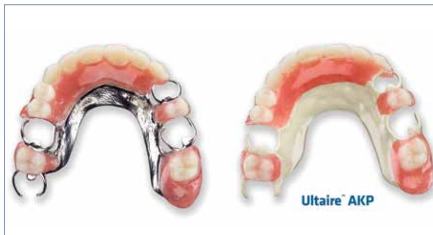
• Zitta’s metal partial vs. her Utaire AKP partial.