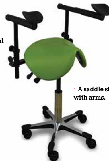
• A saddle stool with arms.