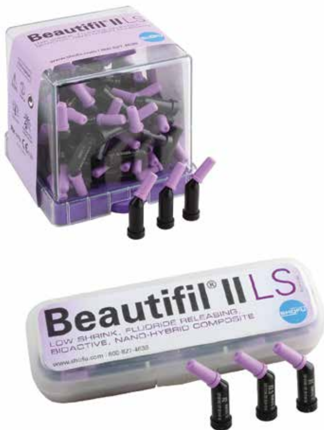
• Beautifil II LS.

tively), maintains ideal color stability and polishes in an instant, producing a long-lasting sheen, according to the company.