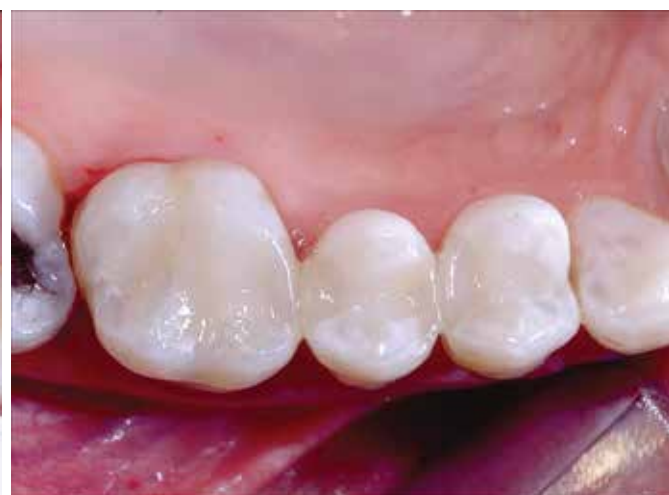
• Functional and naturally beautiful restorations created with Beautifil II LS.