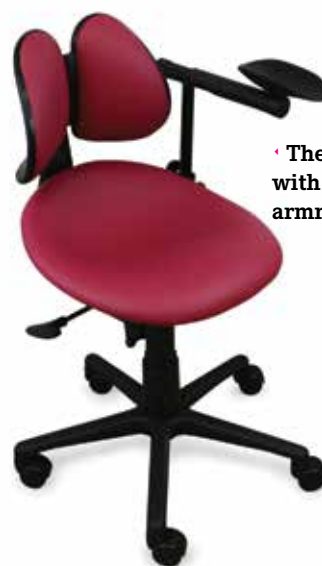
• The 400-D stool with a relaxed armrest.

For more than 20 years, customers have been feeling and seeing the benefits of these telescoping arm supports, and many of our customers attribute the prolonging of their careers to our unique arm support system. All of RGP's stools can easily accept the arm supports. Combining our arm support system with our line of stools and chairs makes for an enjoyable